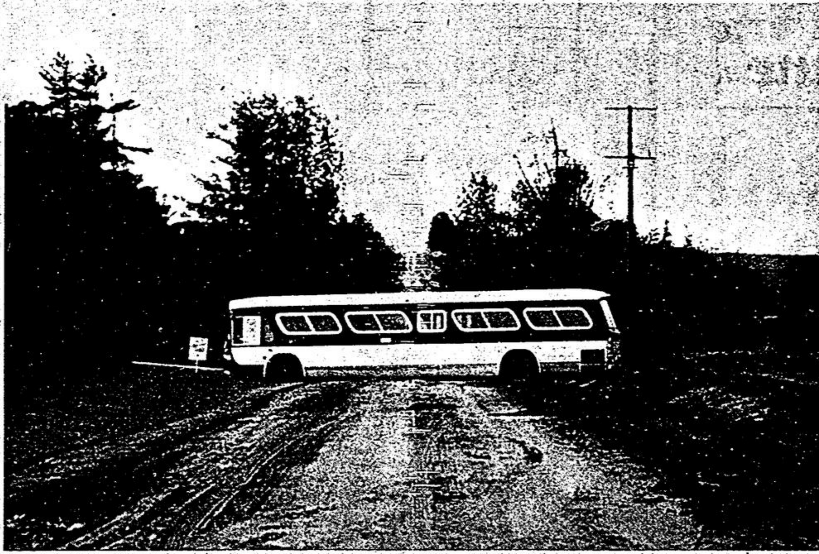
When a driver for a chartered T.T.C. bus left Toronto for Markham, Saturday, he never expected to run into parking problems so far out in the country. However, on 17th Avenue, east of conc. 10, he did, jamming the big vehicle between the north and south ditches, while attempting to turn around.