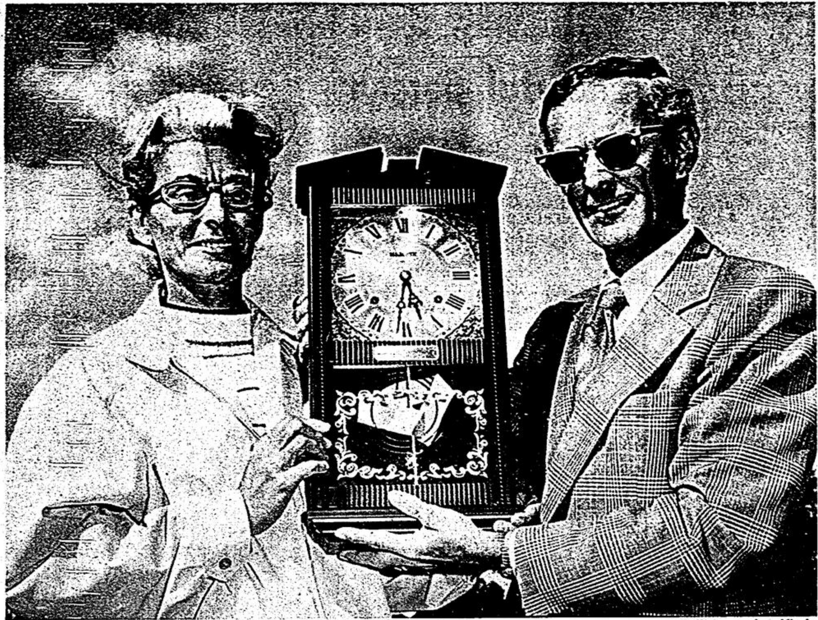
Three years ago, a softball house league was organized in Whitchurch, with 17 teams. Since then, it has expanded to 33 teams, including Squirt, Pee-wee and Bantam. The success of the program has been credited to the work of Mrs.

League champions were declared as follows: Squirt Boys, Preston Lake, The Stouffville Tribune trophy; Squirt Girls, Pine Orchard and Vandorf (tied), Stewart Burnett trophy; Pee-wee Boys, Ballantrae I, Tony Rodgers Memorial trophy; Pee-wee Girls, Stouffville II and Pine Orchard (tied), H. R. Hunt trophy; Bantam Boys, Pine Orchard, the Coaches' Trophy.