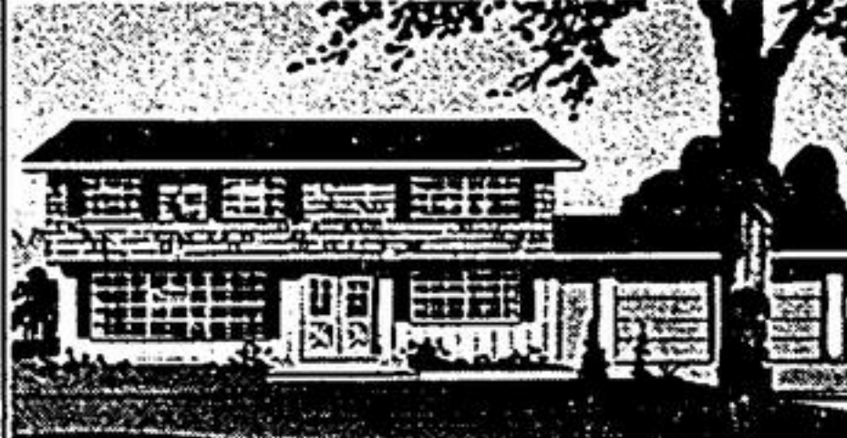
Model illustrated: "Burlington" - Living Area 1800' - 4 bedrooms

Well-planned interiors, attractive styling, sound structural engineering to N.H.A. and V.L.A. requirements... plus the substantial savings made possible by modern mass purchasing and assembly-line production techniques - these are the ingredients that have kept Colonial/Sunnibilt in the forefront of the Manufactured Home Industry for all these years!