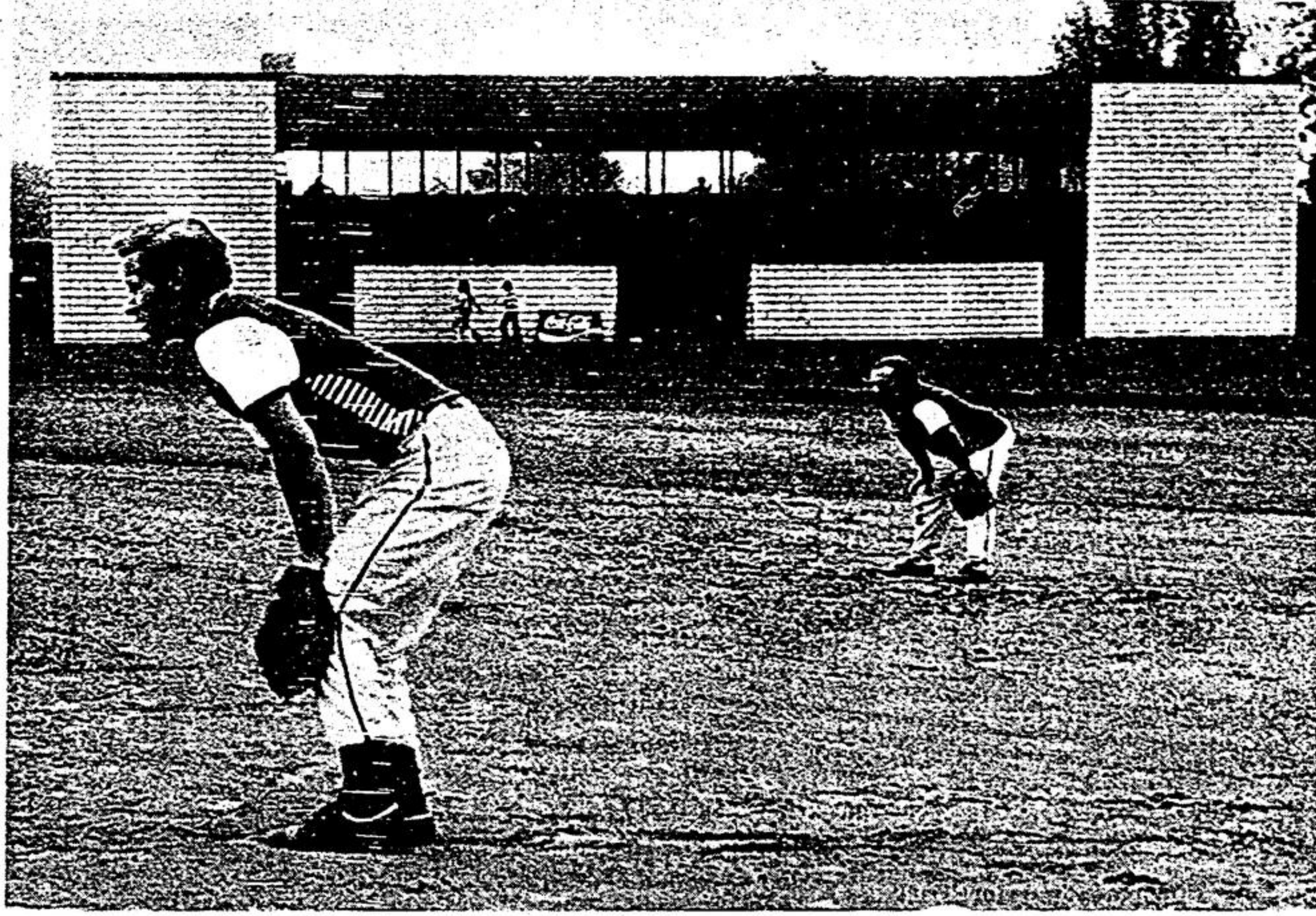
Community Sports Complex takes shape at Greenwood