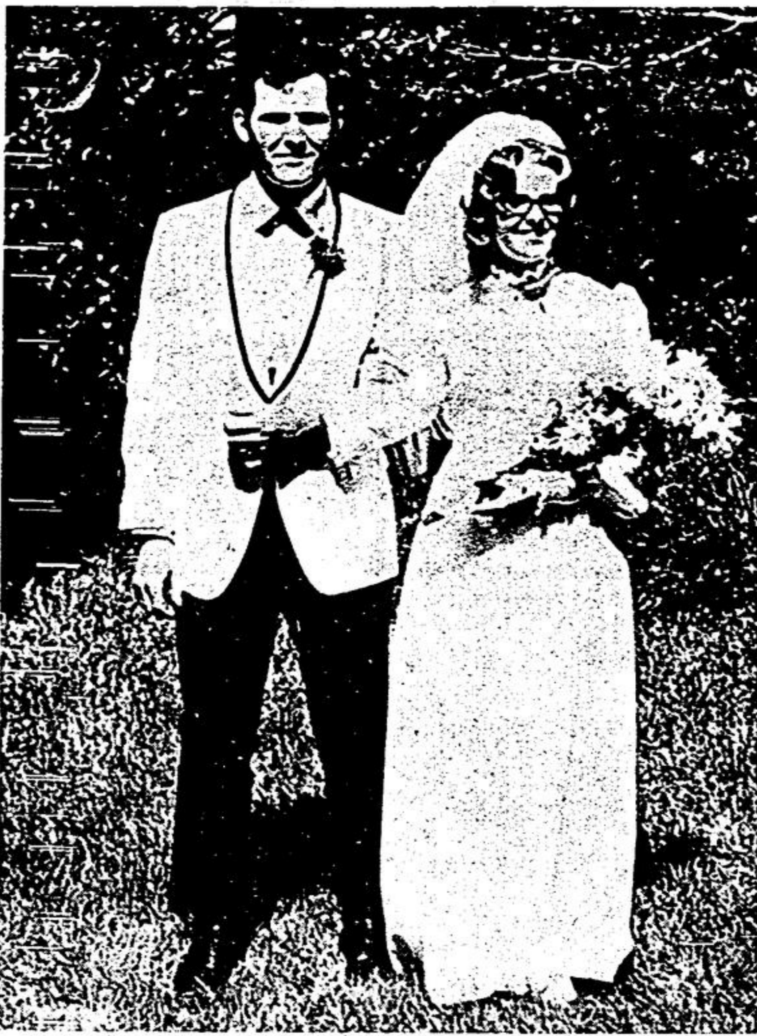
Married at Providence Bay