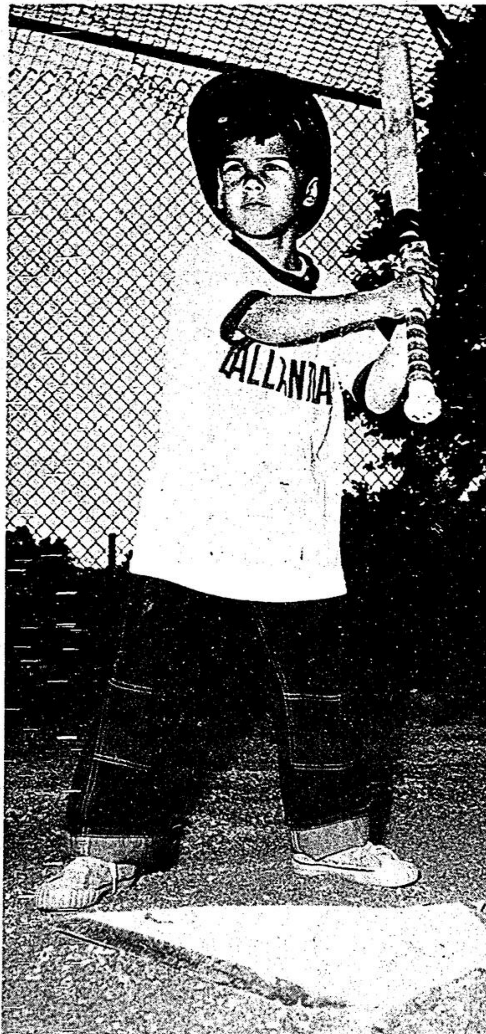
Big year for Little Leaguers

Exercises will include emergency rescue work, relay races and paddle-board races. The public is invited to attend the meet.