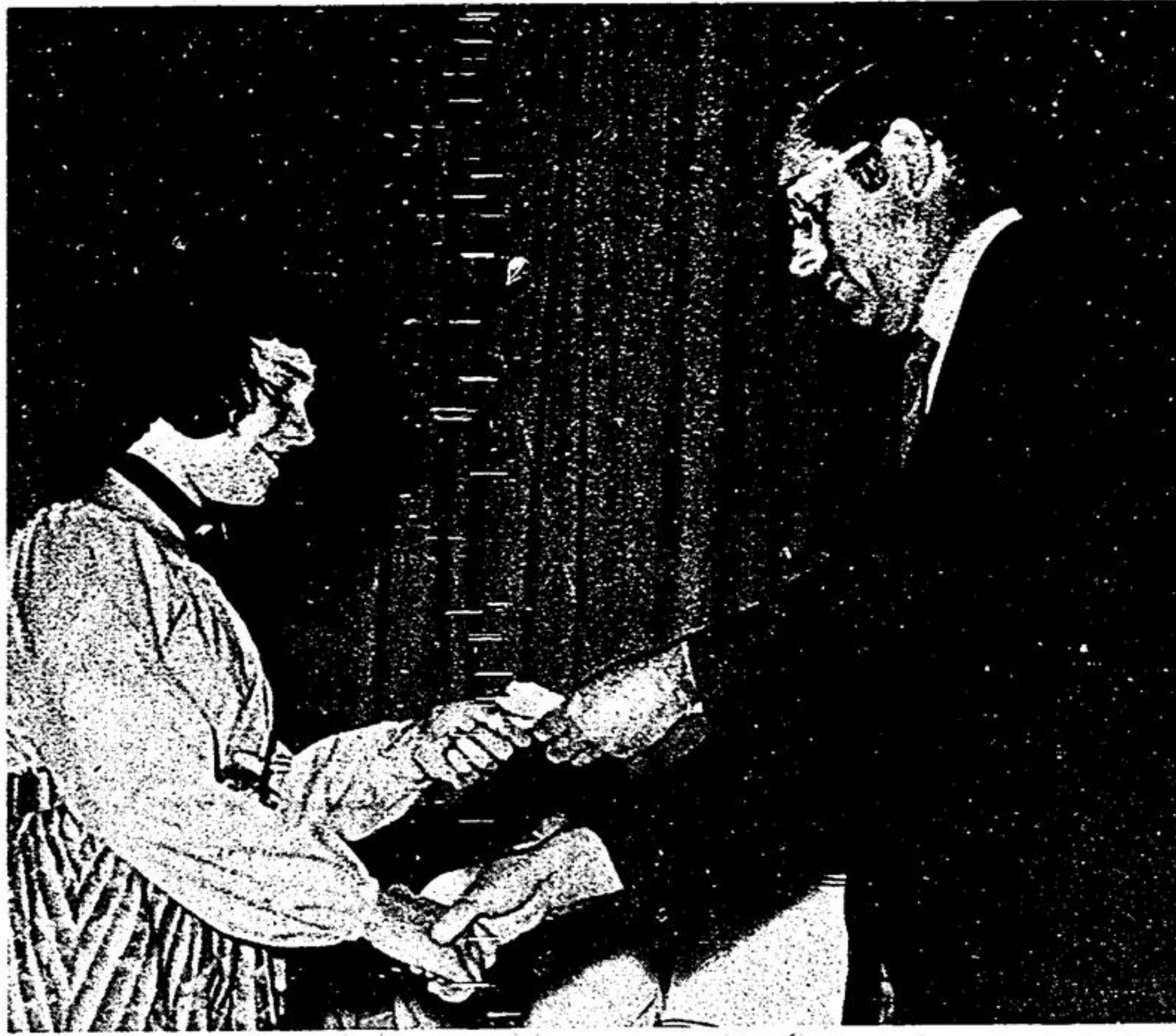
Orchard Park honors award