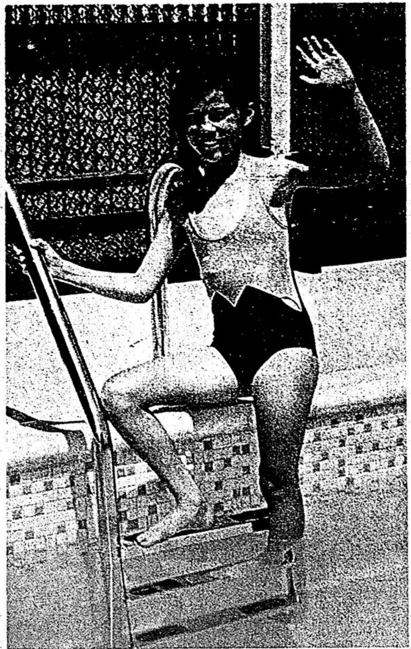
New intermediate pool - wonderful

Wexford will also ice a team in Jr. 'A' competition, but the operation comes under separate ownerships.