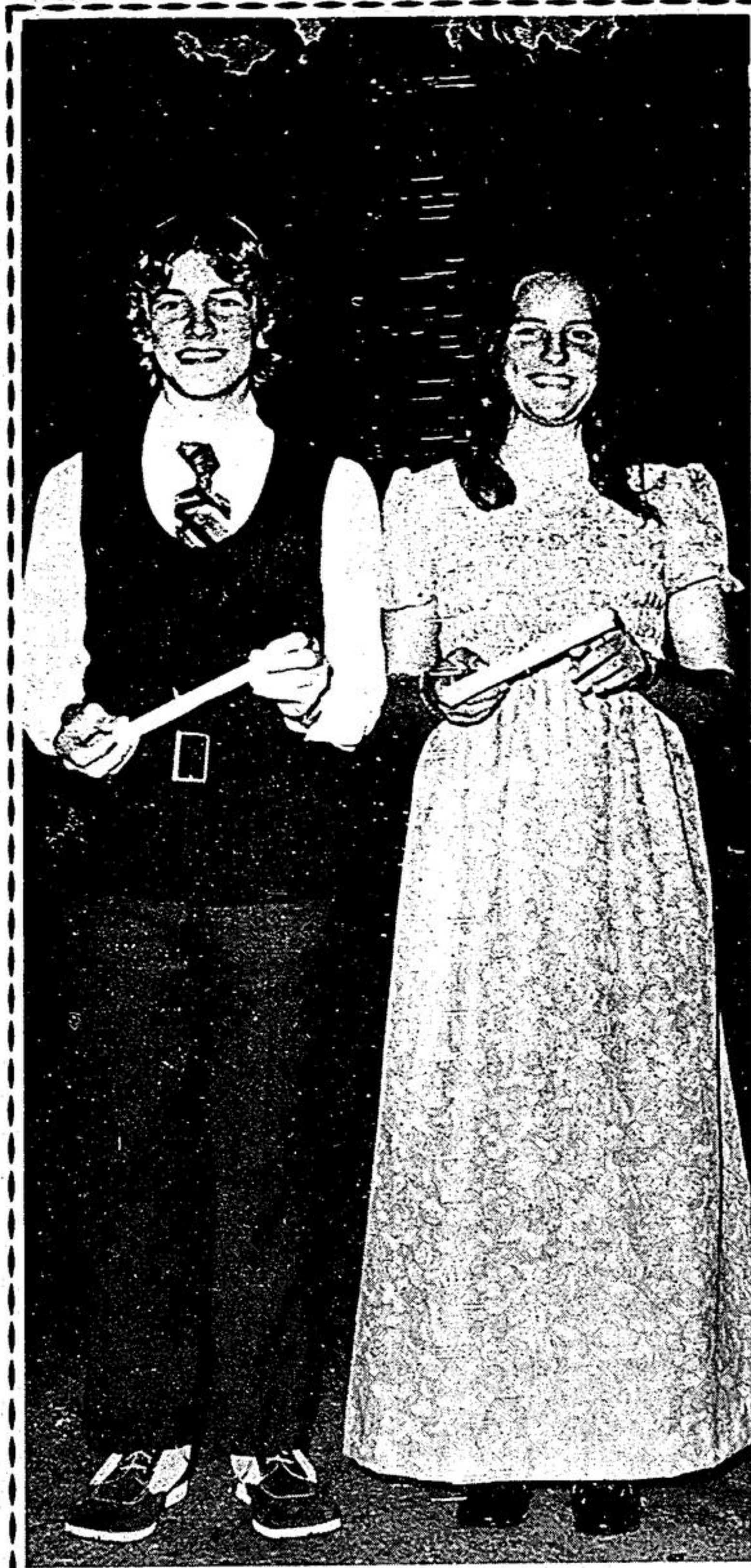
All in the family

The motorcycle was demolished and the truck, with minor scratches, ended up jackknifed at the east side of the road. Mr. Chomko was taken to Centenary Hospital with injuries to head, shoulder and face.