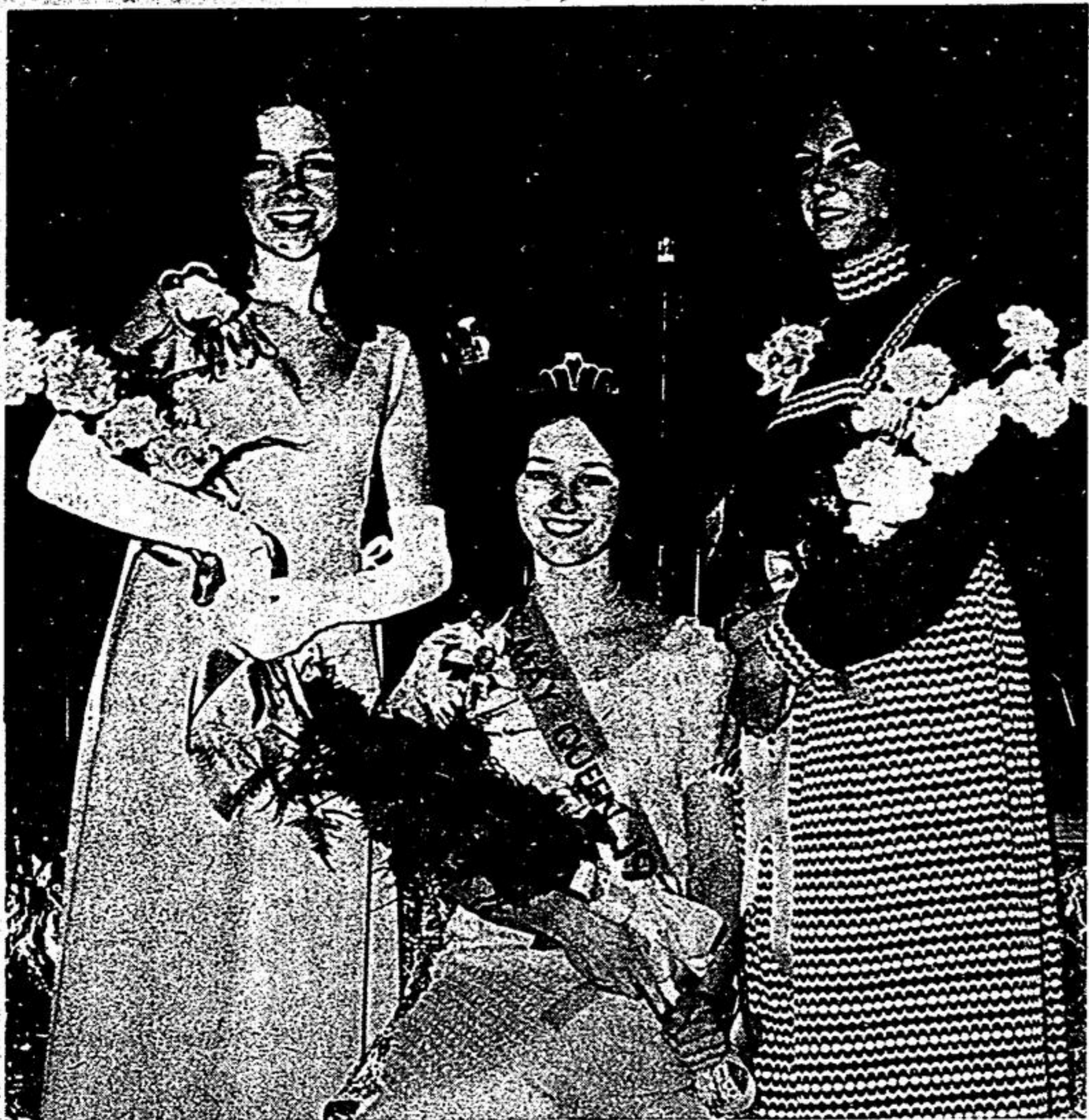
Student 'queen' and attendants