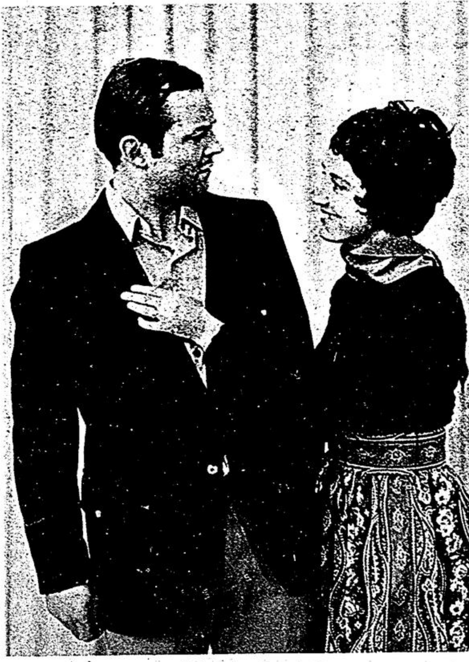
A double feature