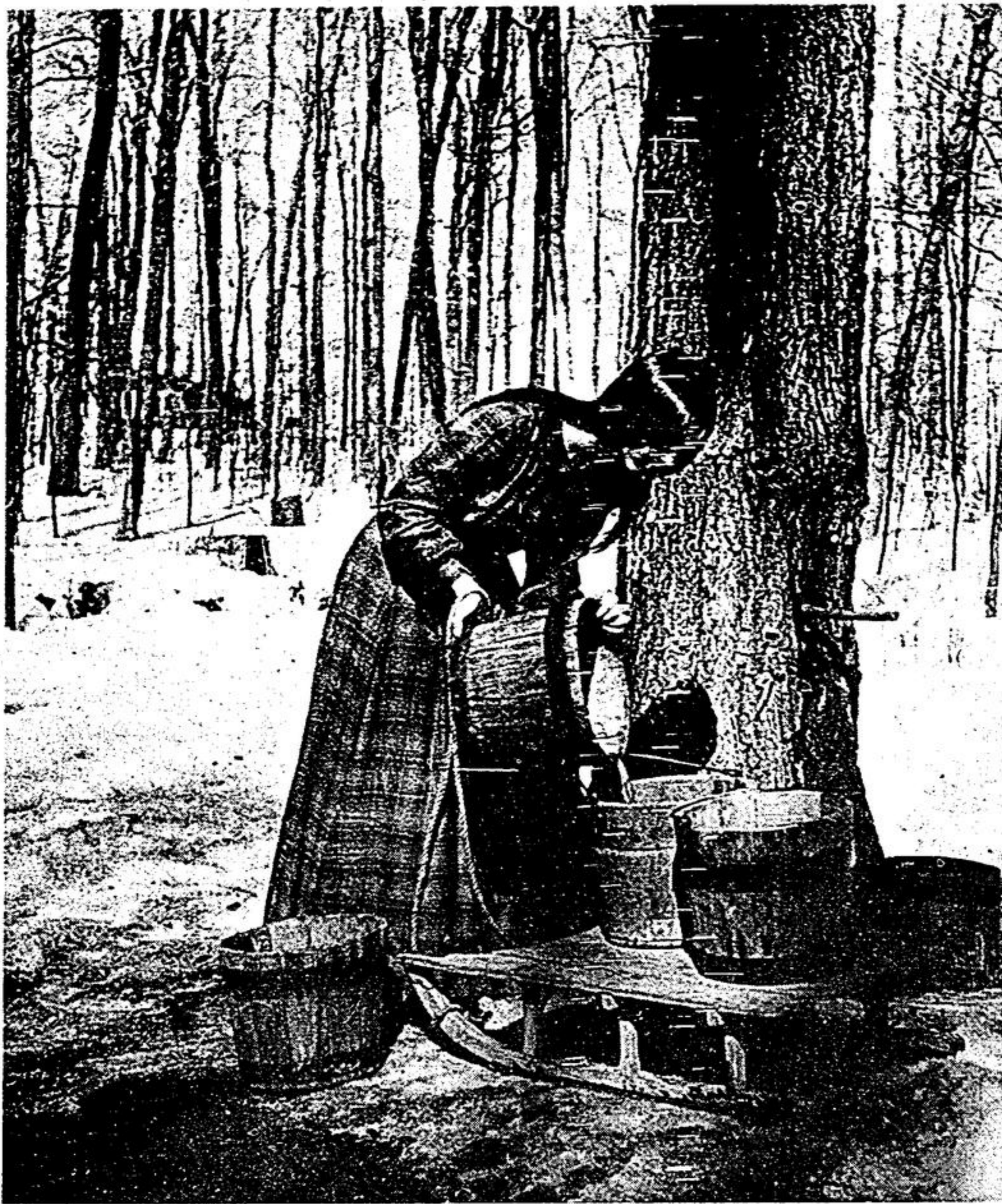
Syrup - crowds set area record