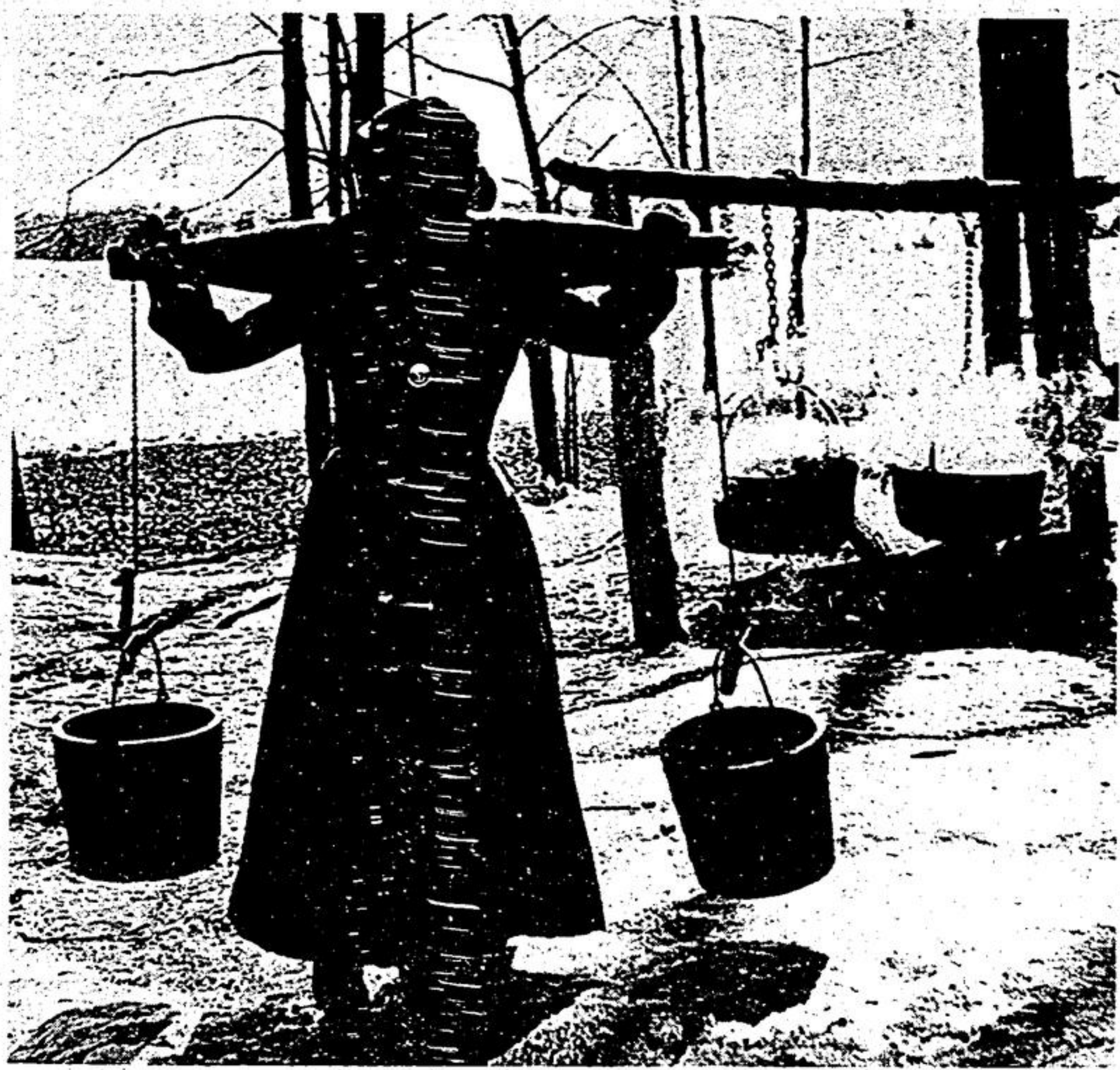
The sap's running at Bruce's Mill

The mid-winter holiday break and the spring maple syrup festival at Bruce's Mill Conservation Area, provides an excellent opportunity for children and adults too, to witness