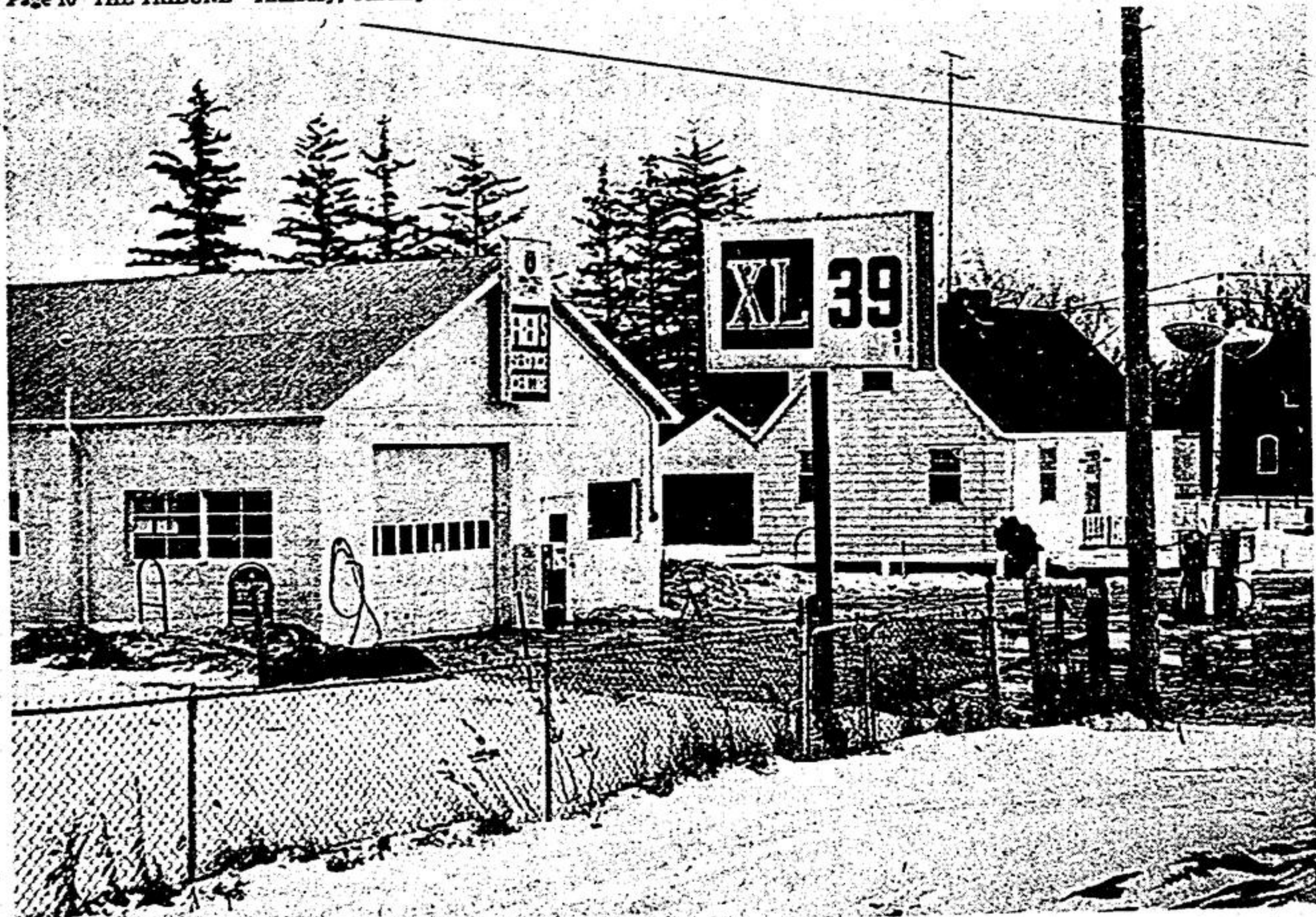
Scene of armed robbery

An armed robbery, Jan. 6 occurred at Fred's Service Centre, Highway 48, north of Ringwood. The thief made off with about $100. York Regional Police have circulated a