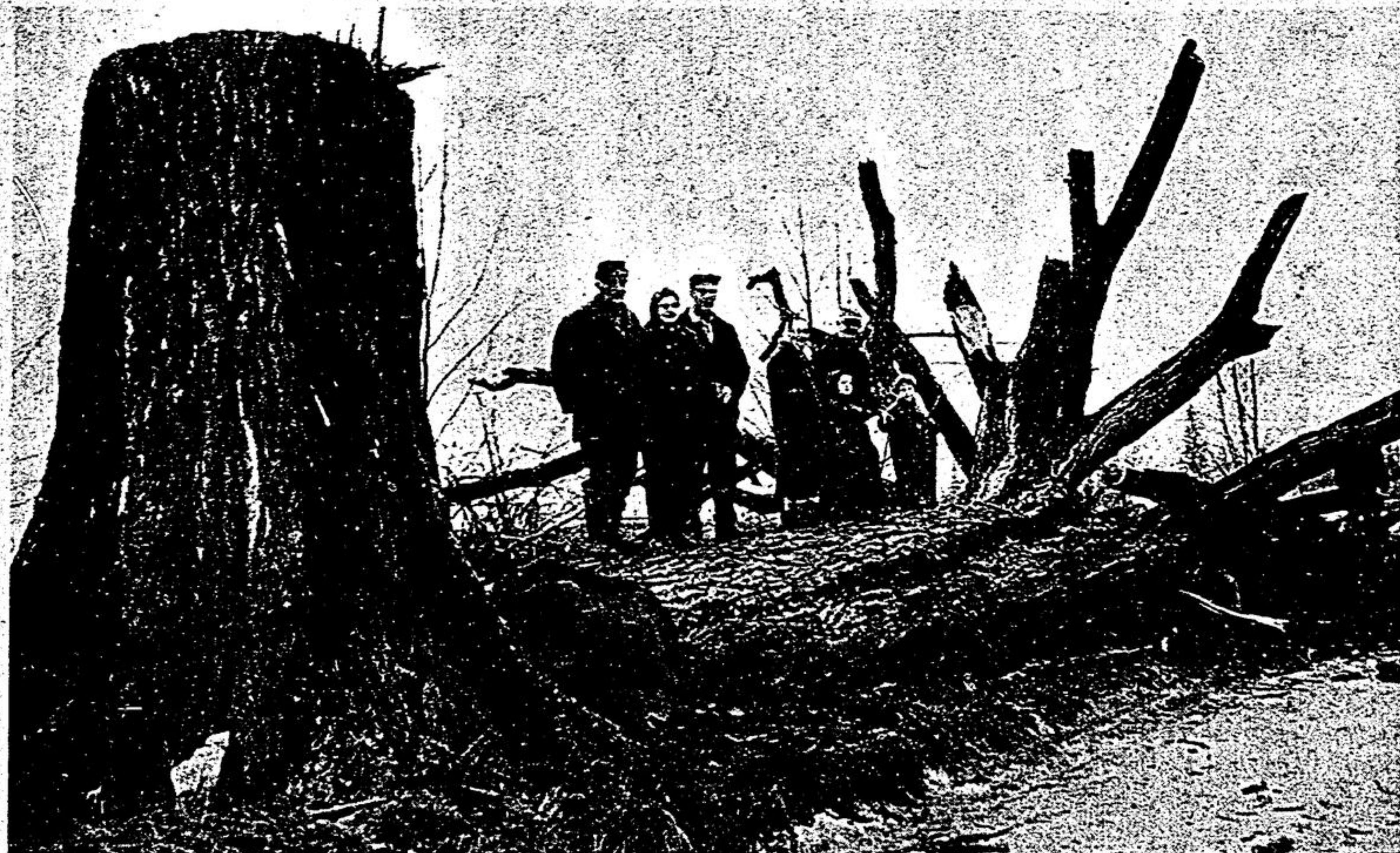
A photo for every Mongolia family album

Fifty years from now, great grandchildren of present-day Mongolia residents will leaf through their dog-eared family albums and note that this giant elm tree, located on 18th Avenue, just west of the hamlet, was felled by Hydro crews and Markham road employees, Dec. 8, 1971. They