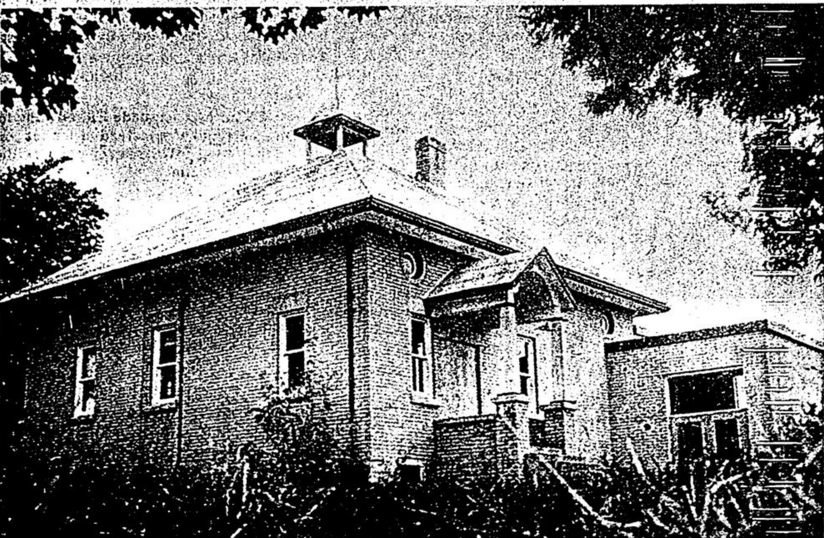
Board of Education approves sale of Lemonville School for $19,000. To be re-modelled for Community Centre.