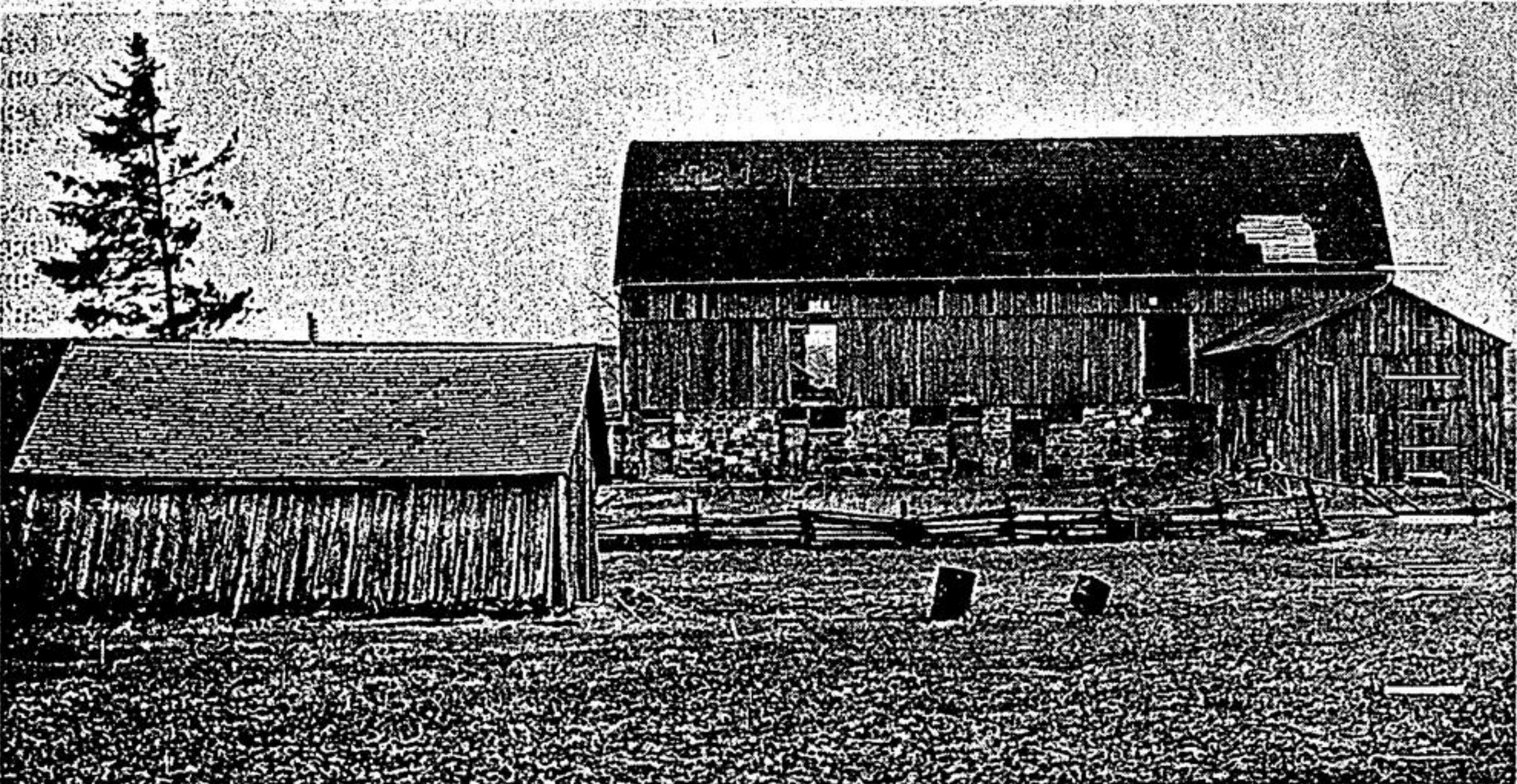
Much-publicized 'Century City' project scrapped by Province. Many properties show signs of deterioration.