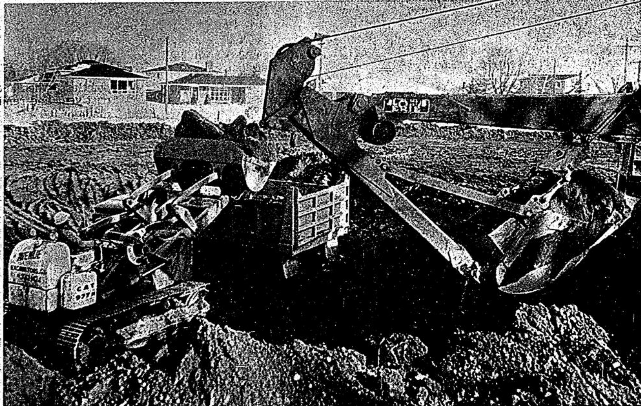
Start is made on third medium-rise apartment located on Albert Street South. Completion date set for April, 1972.