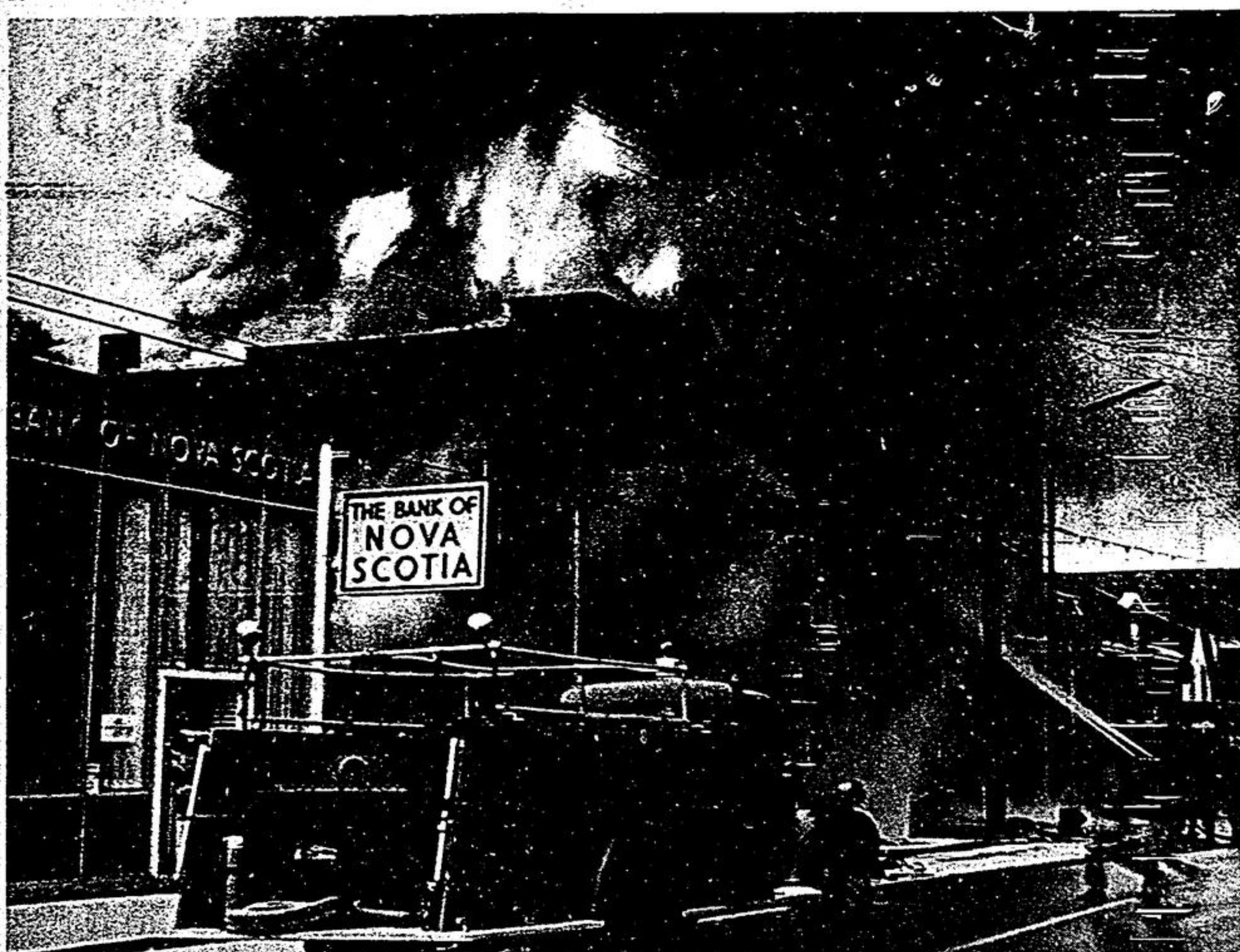
One million dollar fire destroys landmark block in Stouffville; sixteen persons made homeless.