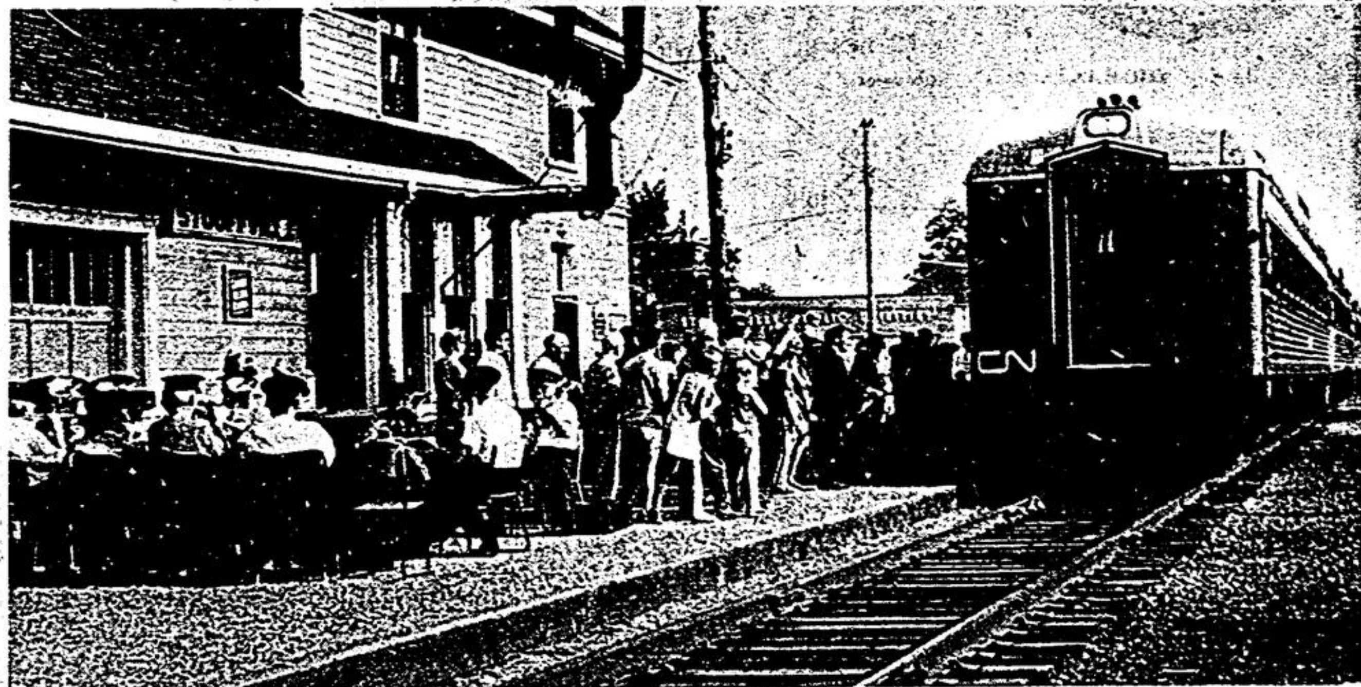
History was made, June 28, with the inauguration of Stouffville to Toronto C.N.R. rail commuter service.