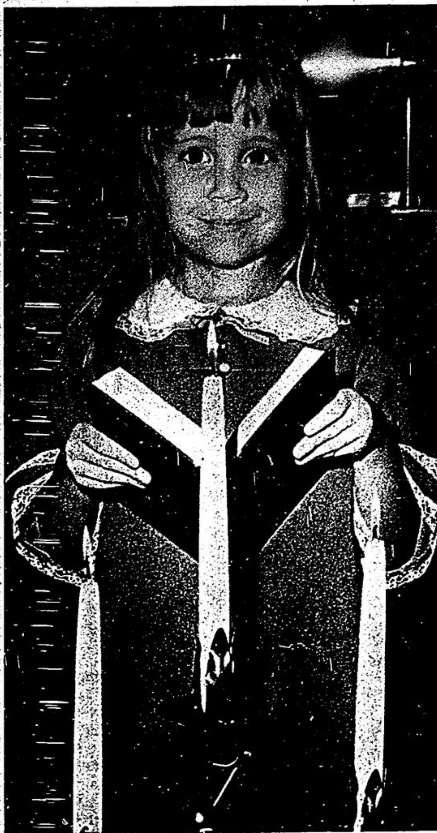
A little bit of heaven