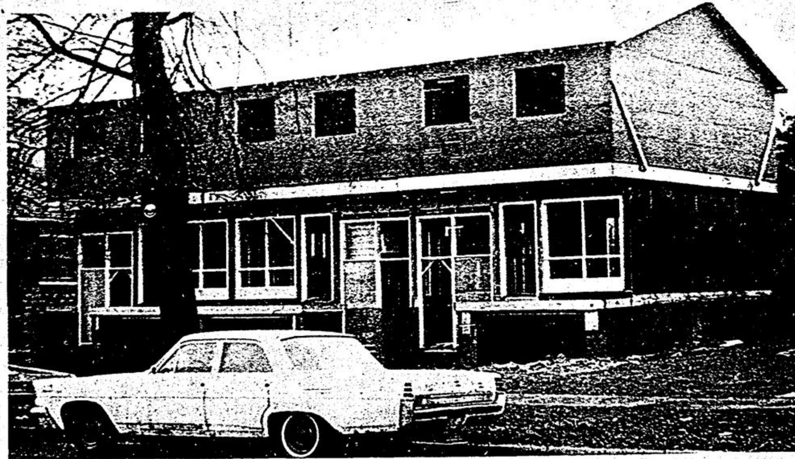
This triplex, being erected on Main St. W., was the subject of considerable discussion at a recent Planning Committee meeting. If an application presently before the Committee of Adjustment is successful, each unit will have a frontage of about 17 feet.