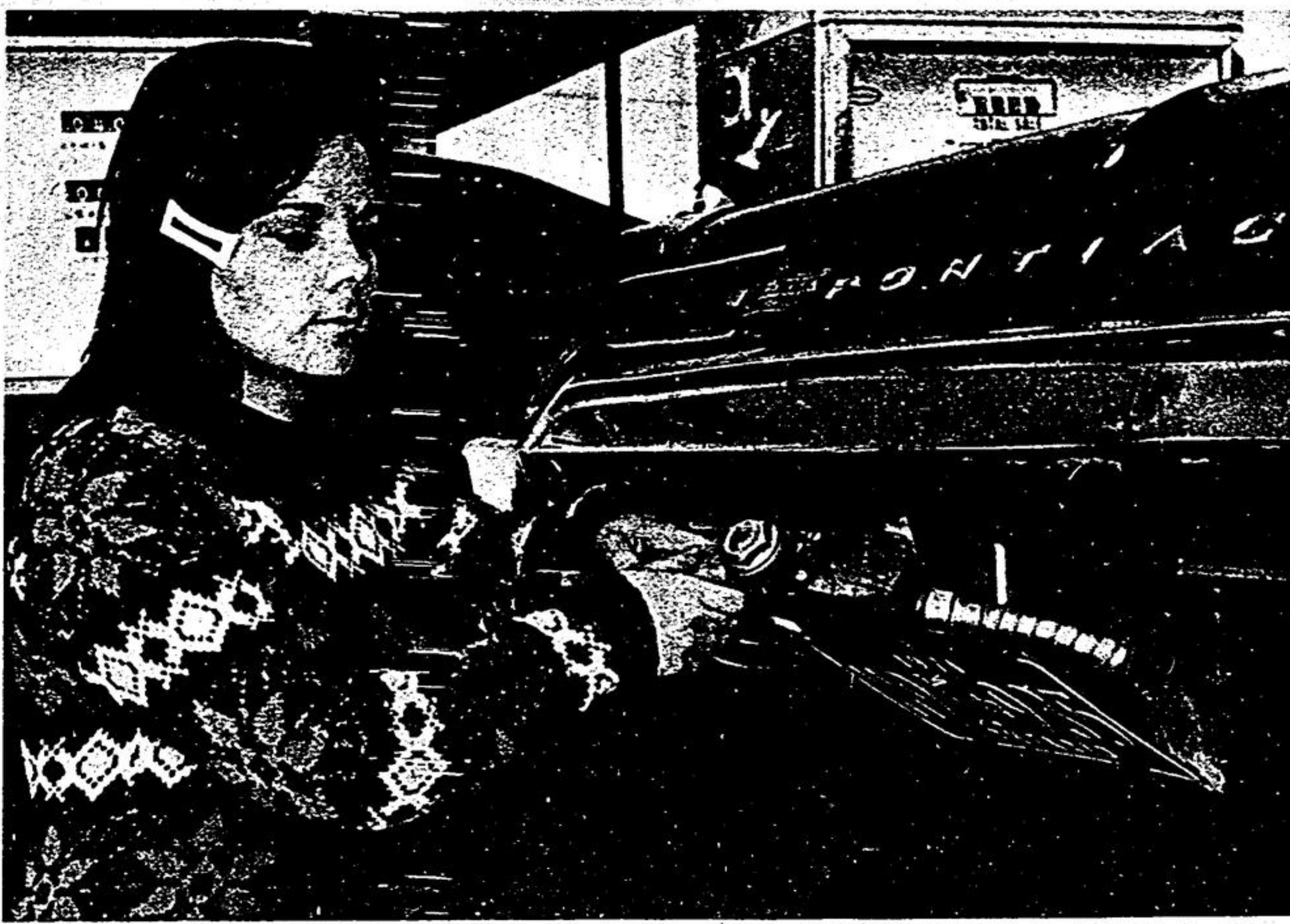
A bargain plus a bonus at new Main St. gas mart