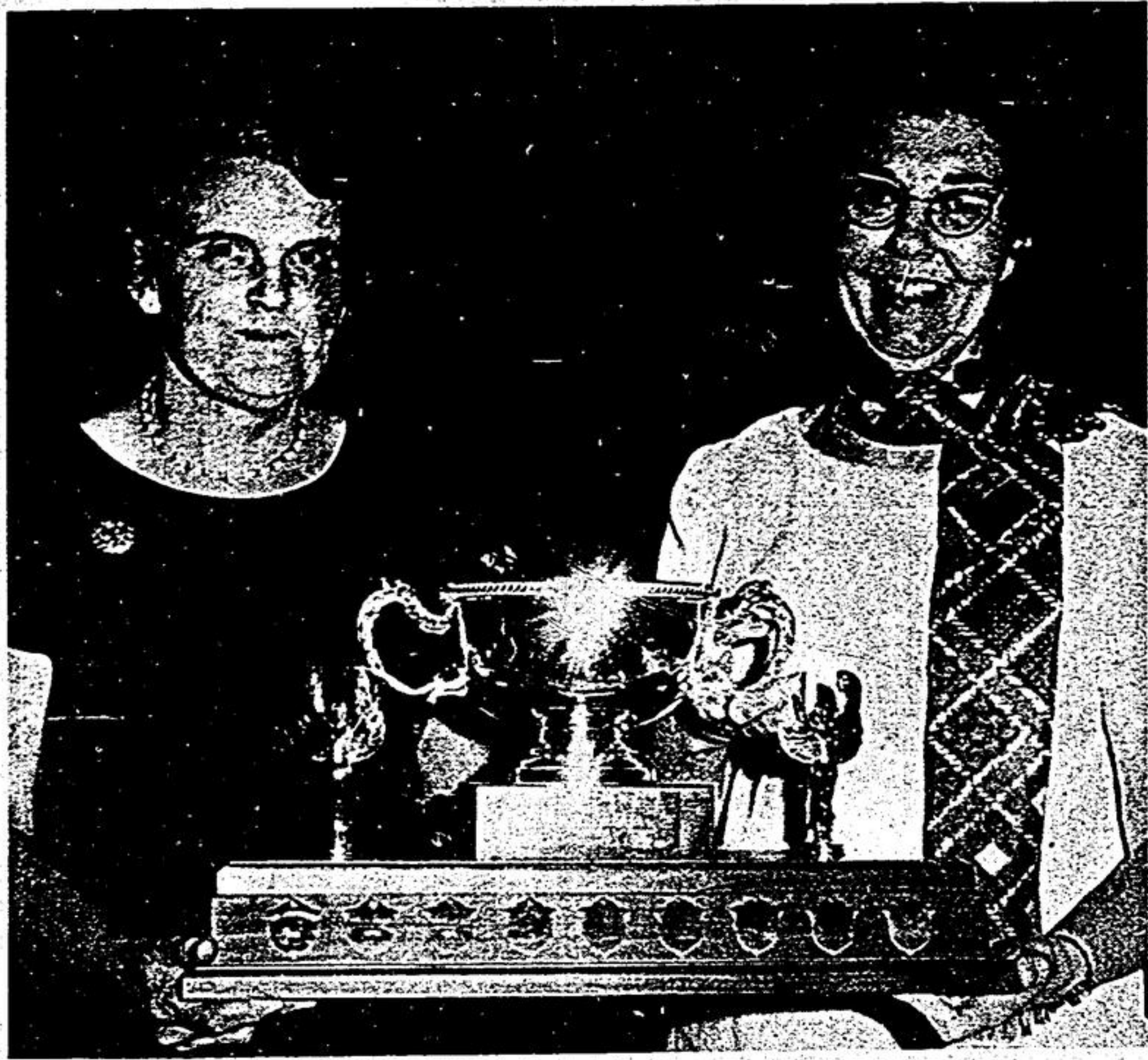
'She can bake a cherry pie'