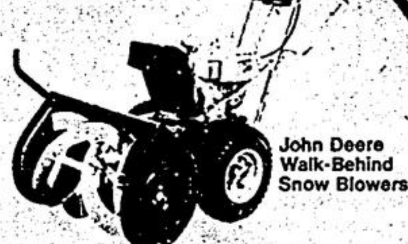
John Deere Walk-Behind Snow Blowers