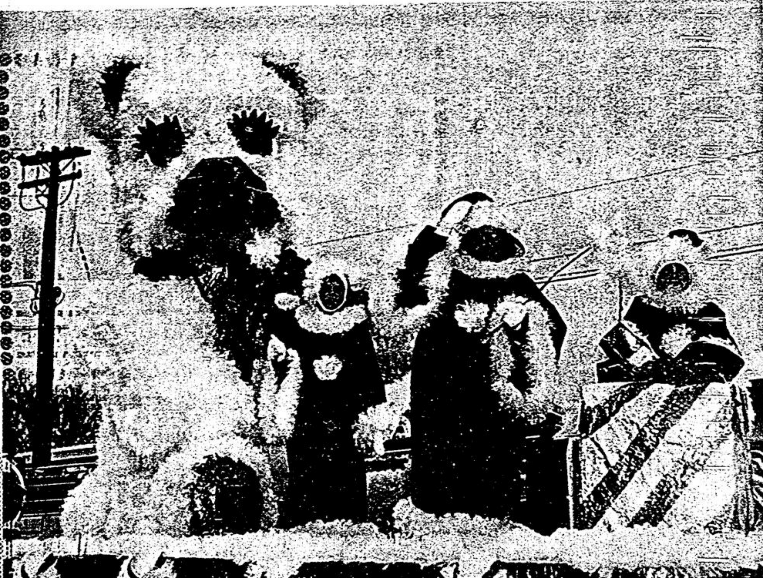
'Winking' bear wows parade watchers at Markham Santa Claus was a busy man, Saturday, arriving at Markham in the morning and at Stouffville in the afternoon. In the Markham procession, a huge 'winking' bear added a touch of professionalism to their parade. The entry was by Markham Cleaners, Hwy. 7.