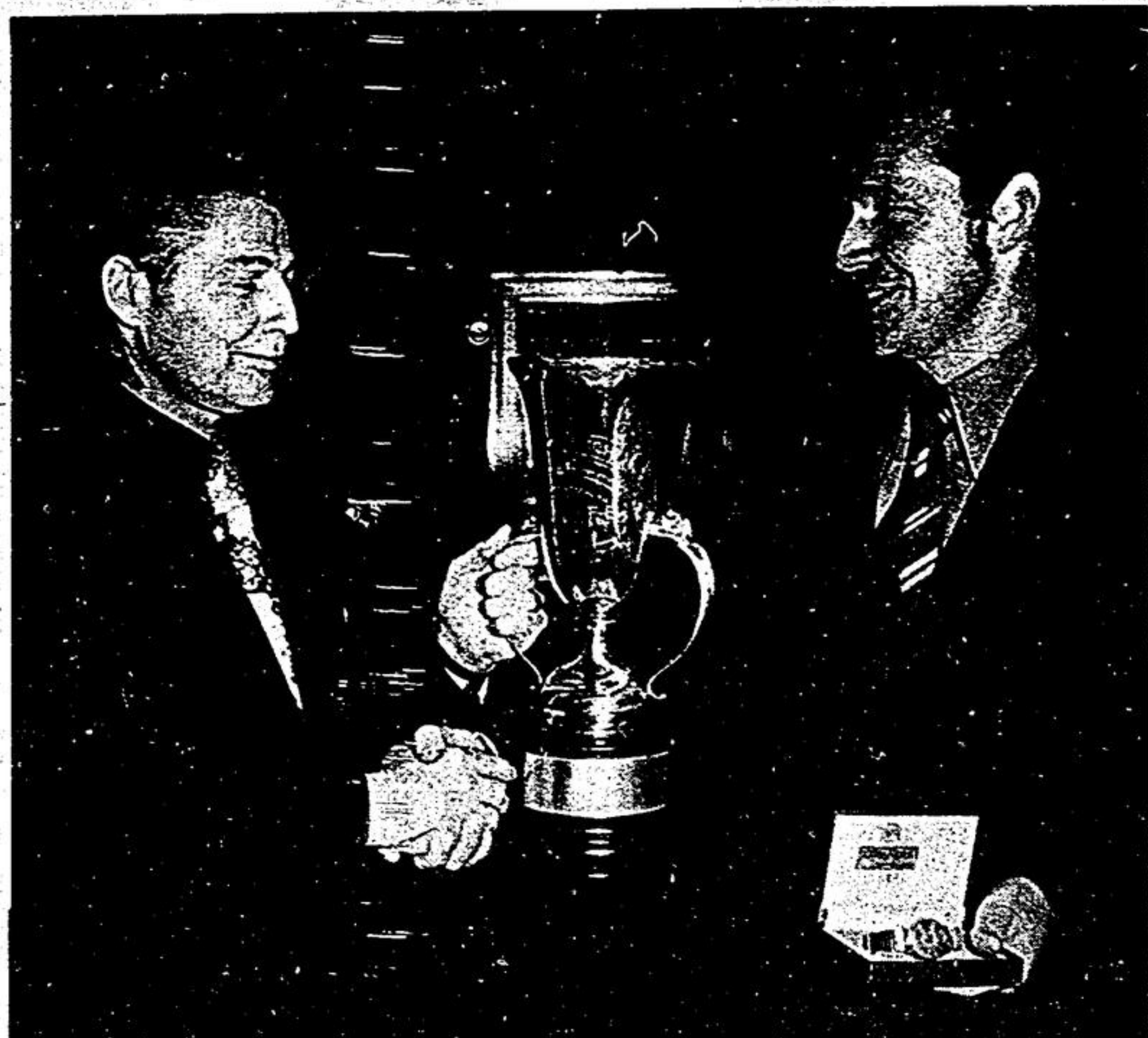
Timbers' family name common in winners' circle.