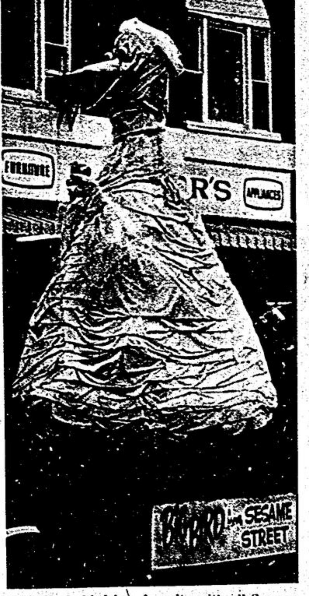
This large bird is a favorite with all Sesame Street fans. It was an entry by Card's Dominion Hardware in the Santa Claus parade, Saturday.