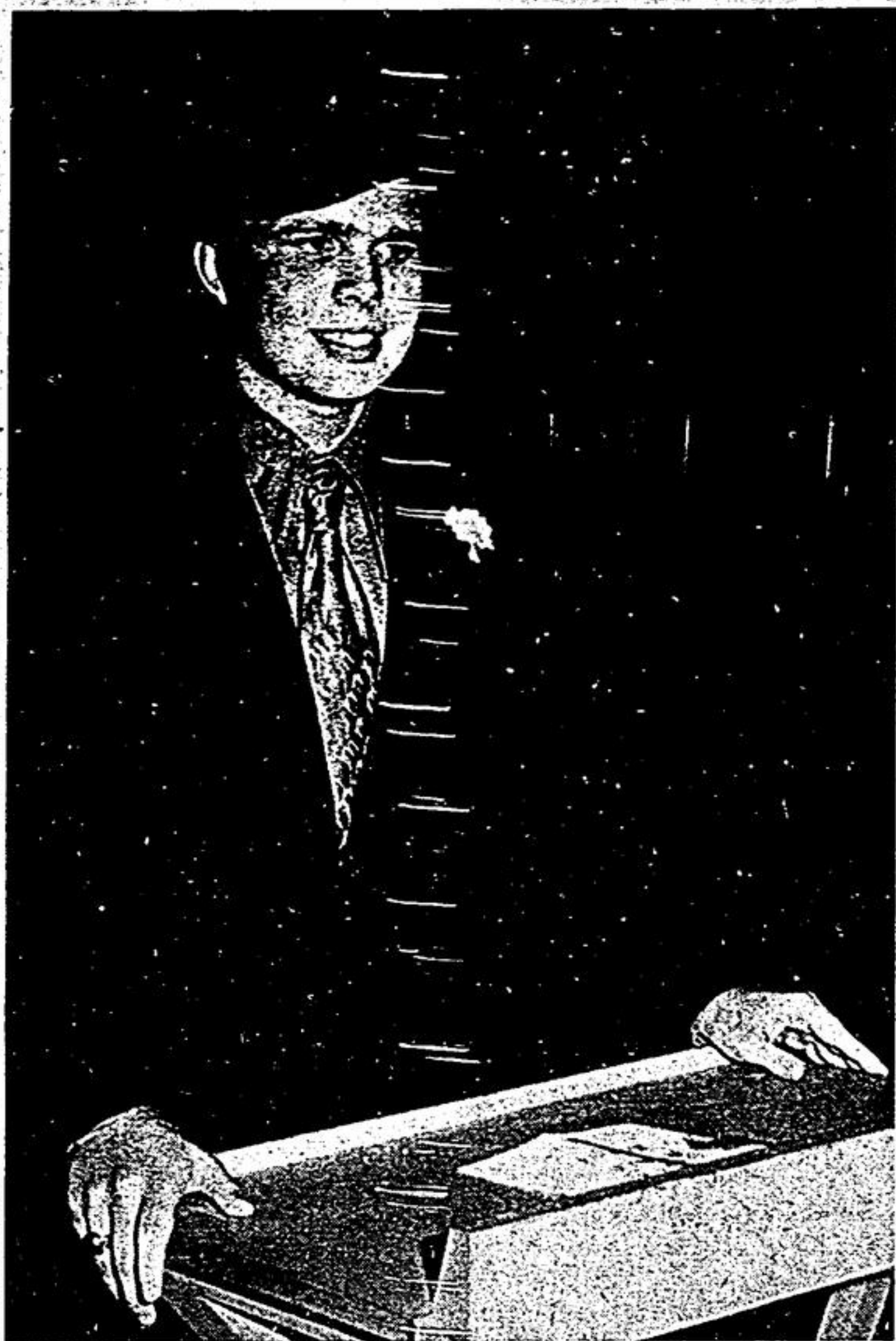
Stirring valedictory address