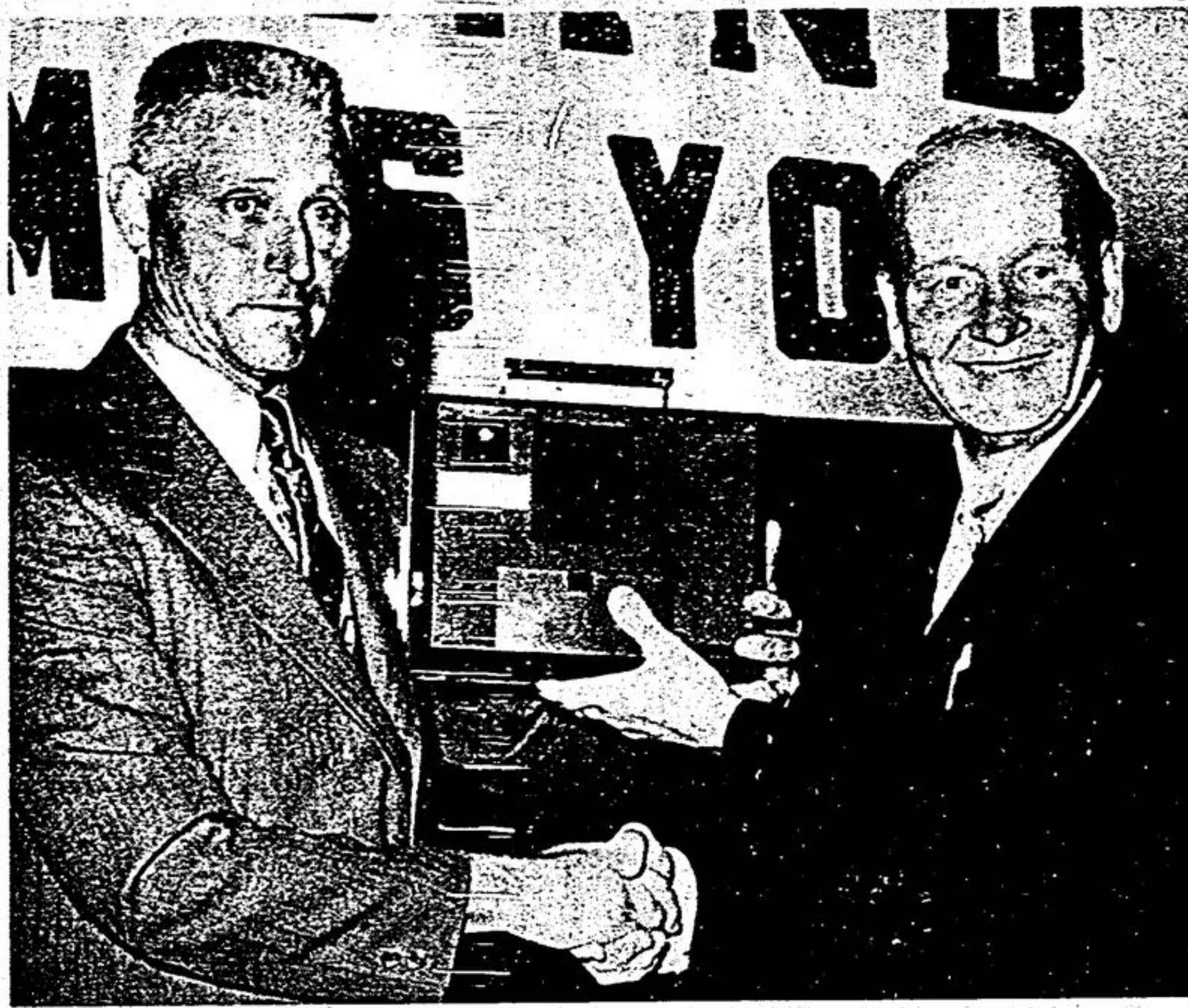
Agincourt plowman wins award