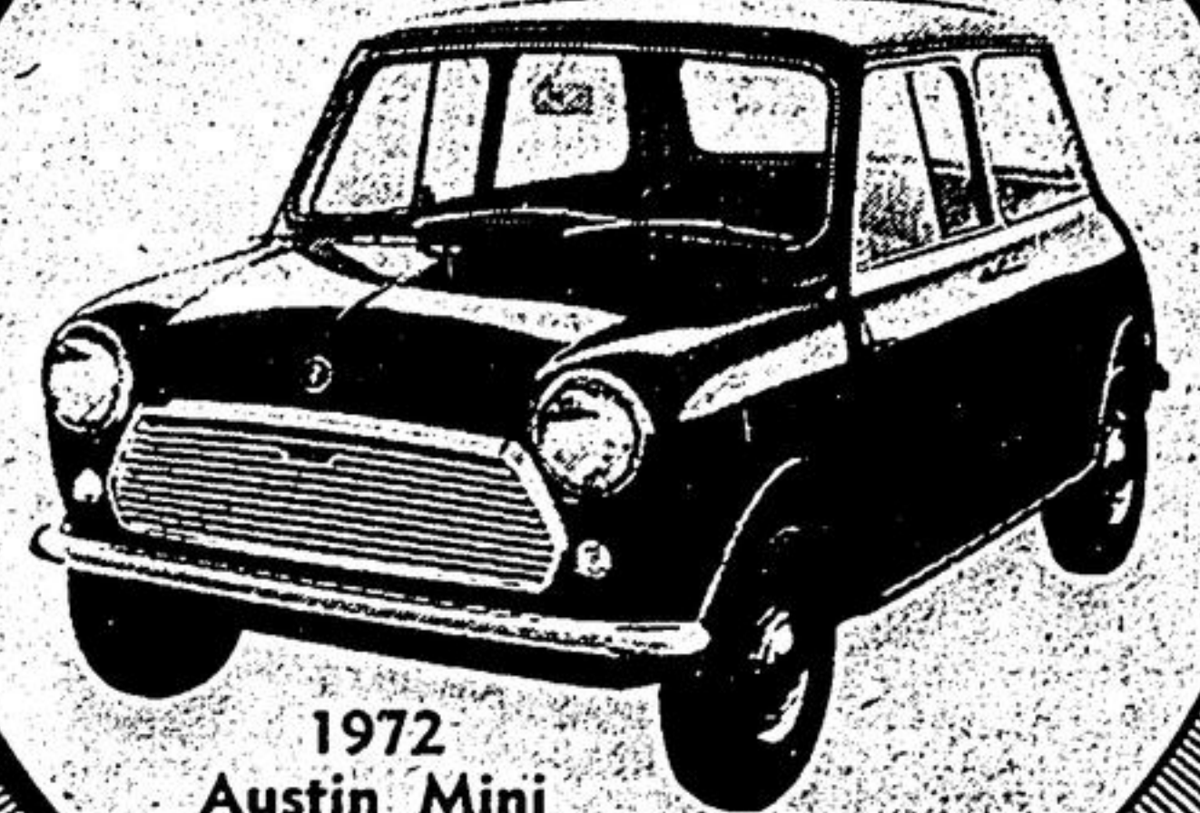
1972 Austin Mini

Full Line of AUSTINS Starting at $1795.00