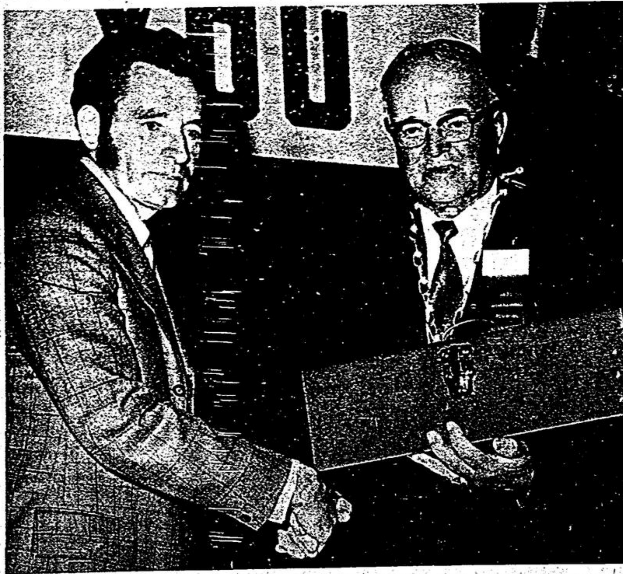
Two awards for Sunderland District plowman

Excessive healing substance proves to shrink hemorrhoids and repair damaged tissue. A renowned research institute has found a unique healing substance with the ability to shrink hemorrhoids painlessly. It relieves itching and discomfort in minutes and speeds up healing of the injured, inflamed tissue. In case after case, while gently relieving pain, actual reduction (shrinkage) took place. Most important of all - results were so thorough that this improvement was maintained over a period of many months. This was accomplished with a new healing substance (Bio-Dyne) which quickly helps heal injured cells and stimulates growth of new tissue. Now Bio-Dyne is offered in ointment and suppository form called Preparation H. Ask for it at all drug stores. Satisfaction or your money refunded.