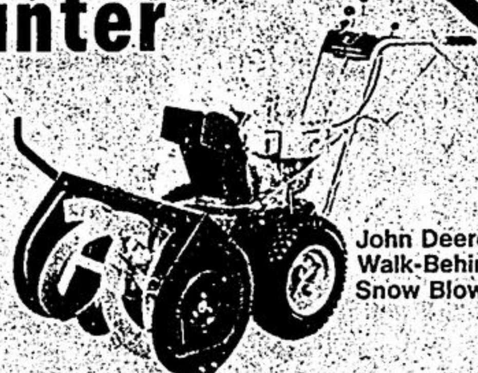
John Deere Walk-Behind Snow Blowers