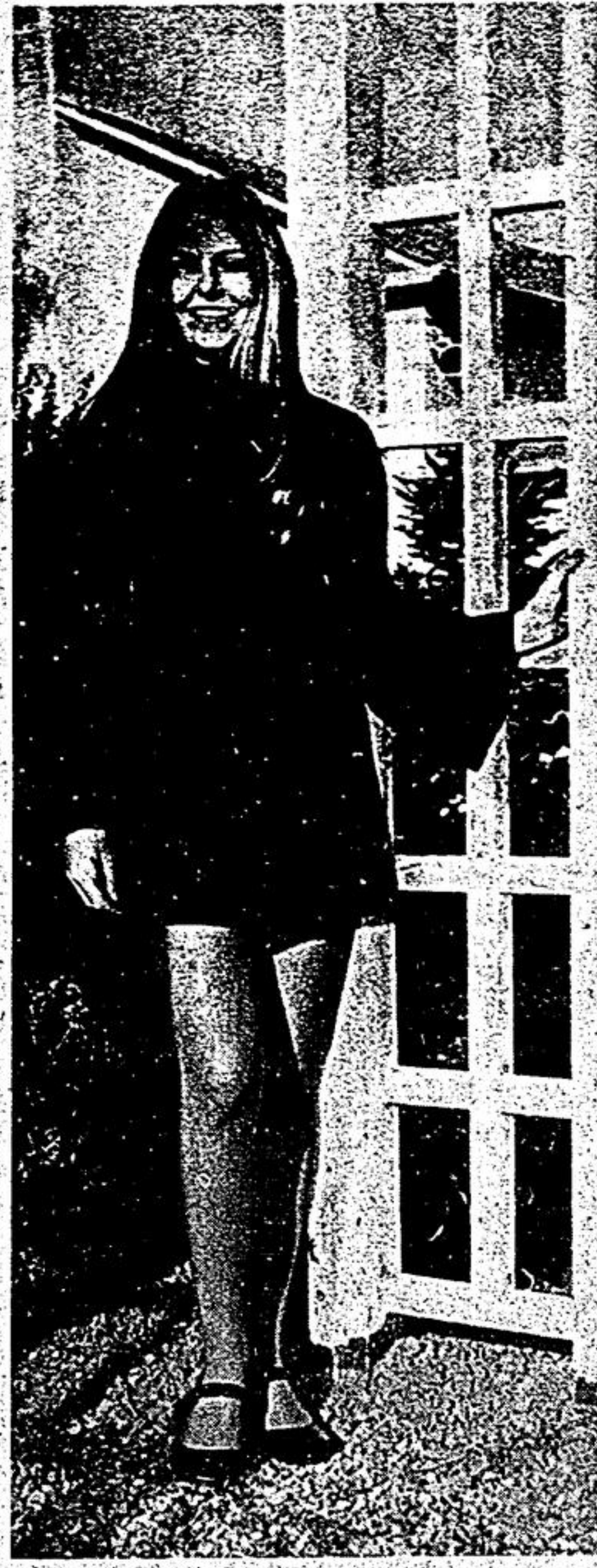
winner received $325 in luggage; a full-color cash; a $100 wardrobe; portrait and an a set of matched electric hair dryer.