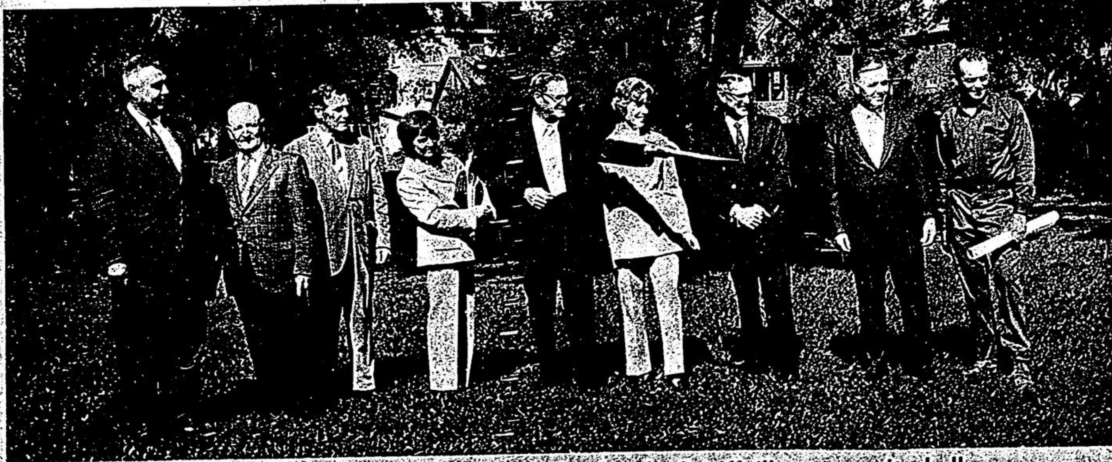
Town Council survey site of new Whitchurch-Stouffville community hall