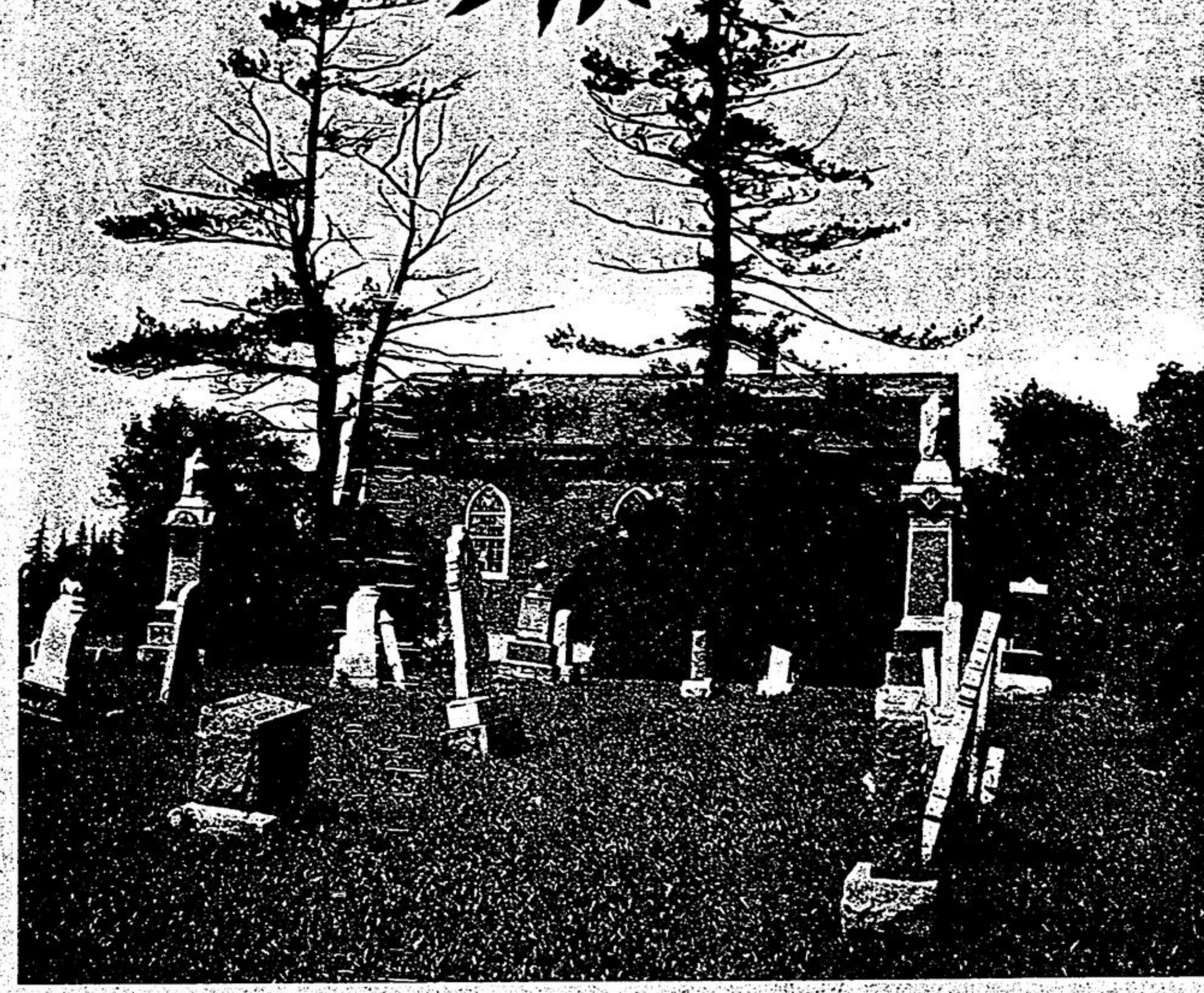
First Markham Baptist Church, conc. 9, Markham, held its final service, Sunday evening. Although closed for several years, it was re-opened one night annually, for worship. The building's construction dates back to 1848 with some cemetery stones going back to the early 1850's.