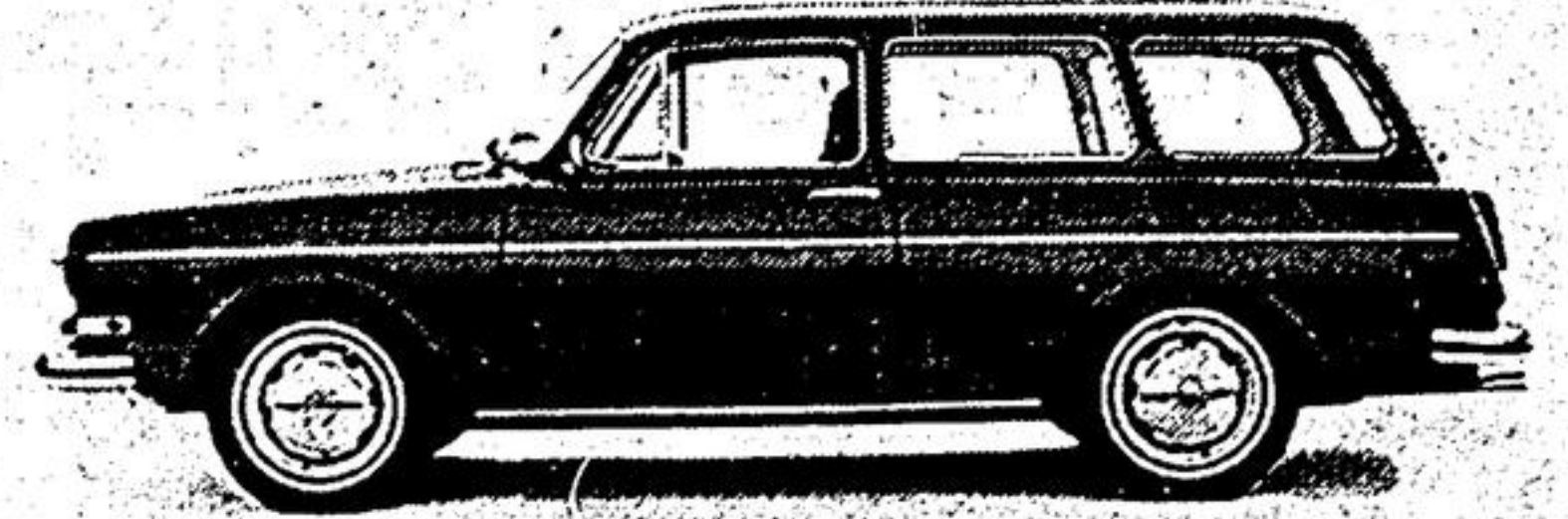
The Volkswagen Squareback Sedan.

Getting a 3' high object into a 2' high trunk is a neat trick. If you can do it. But when a Volkswagen Squareback Sedan gets into the act, the problem disappears. How? Just open the Squareback's big back door and abracadabra, 42 cubic feet of thin air for the problem to disappear into. But here's the best trick of all: when you're through using it as a station wagon—Presto-Changeo! It turns into a family sedan. Ladies and gentlemen: the VW Squareback Sedan. Now... Do we have any volunteers from our audience?