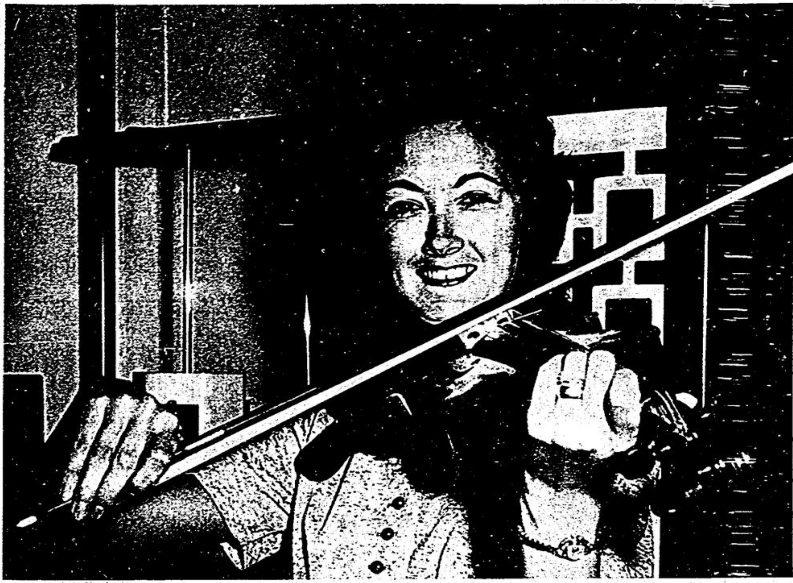
Plays way to Ontario championship