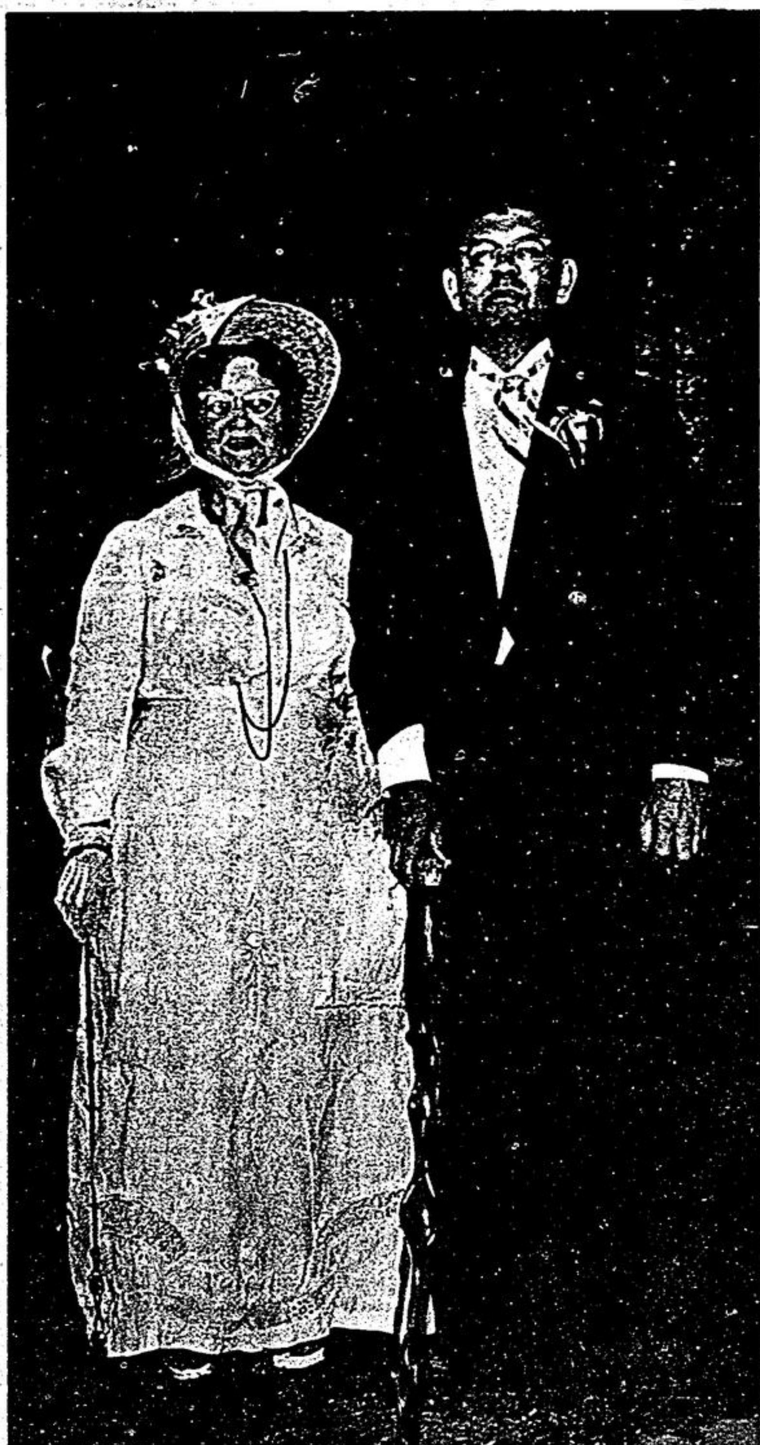
Sees a dream come true