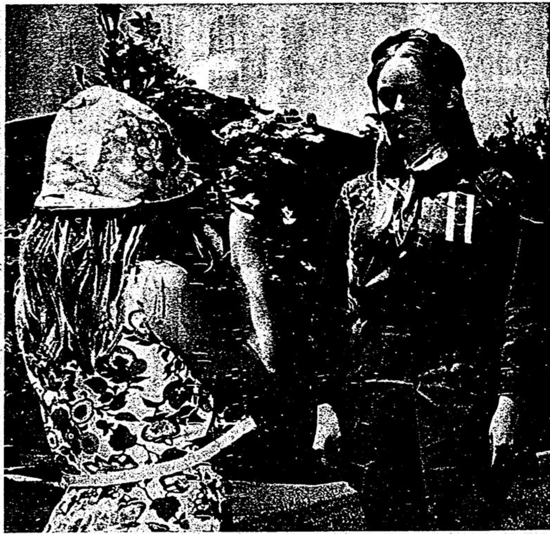
An 'all-round' Guide