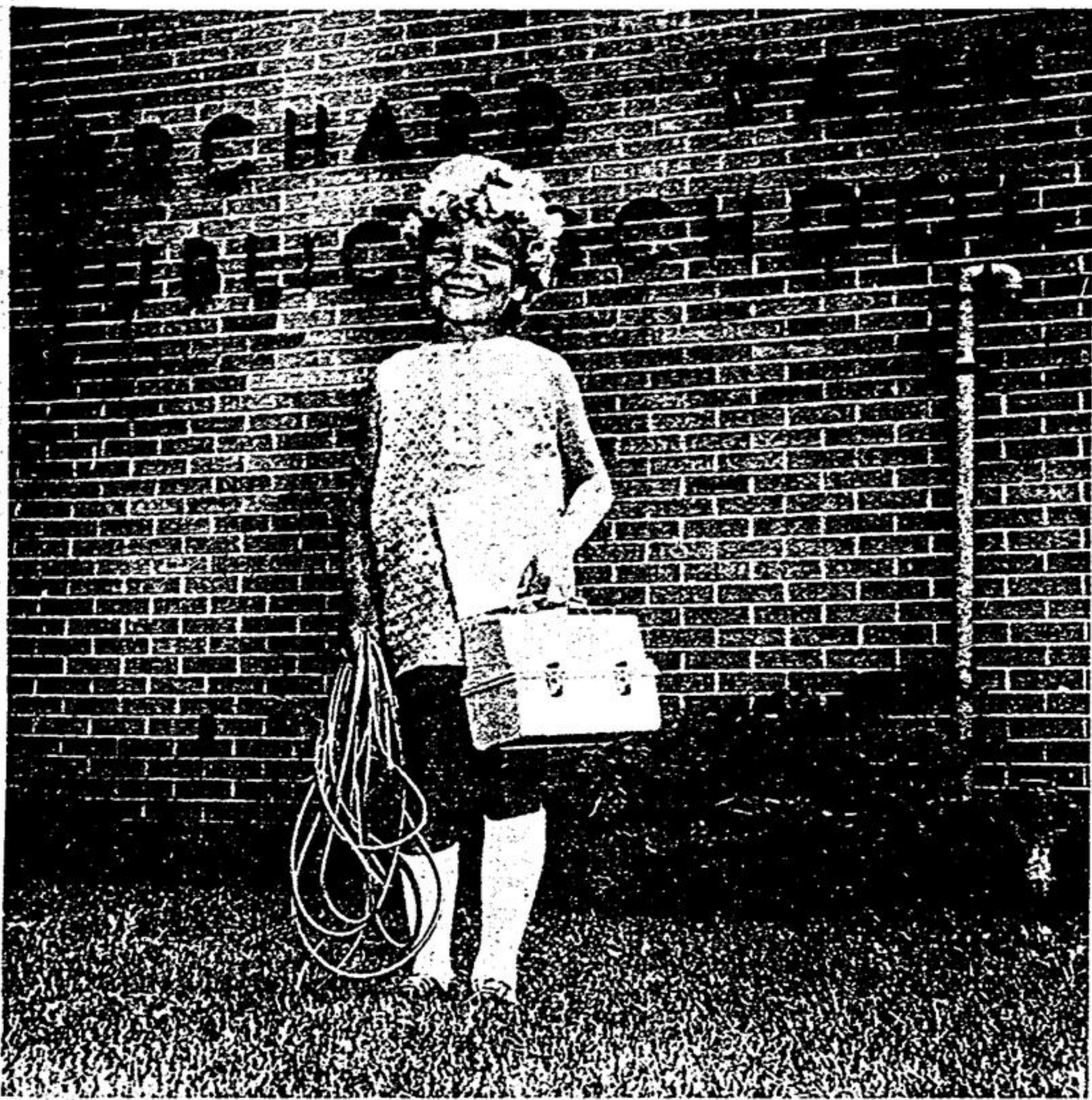
Vacation time — it's great