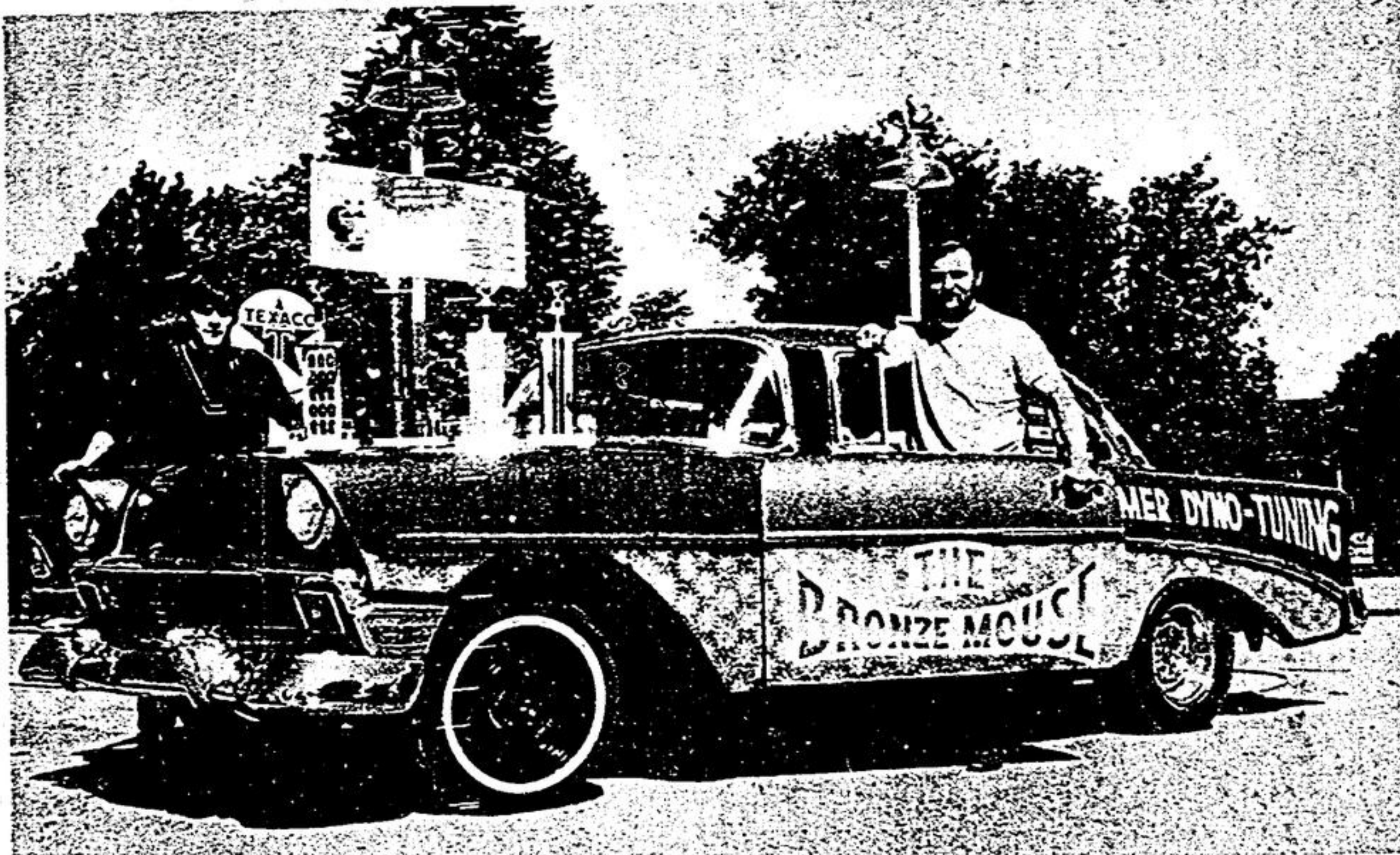
'The Bronze Mouse' burns up Cayuga track