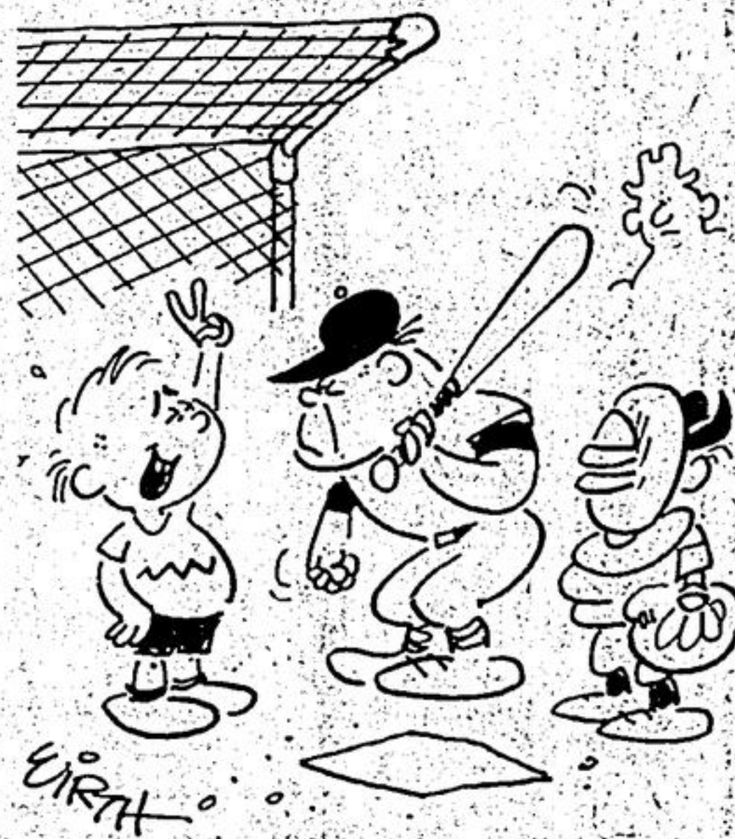
"Good heavens! That doesn't mean strike two, it's the peace sign!"