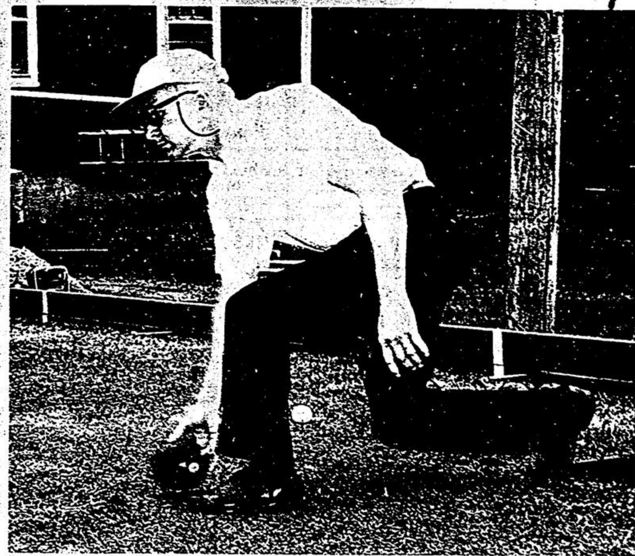
Bowler shows delivery form in tournament