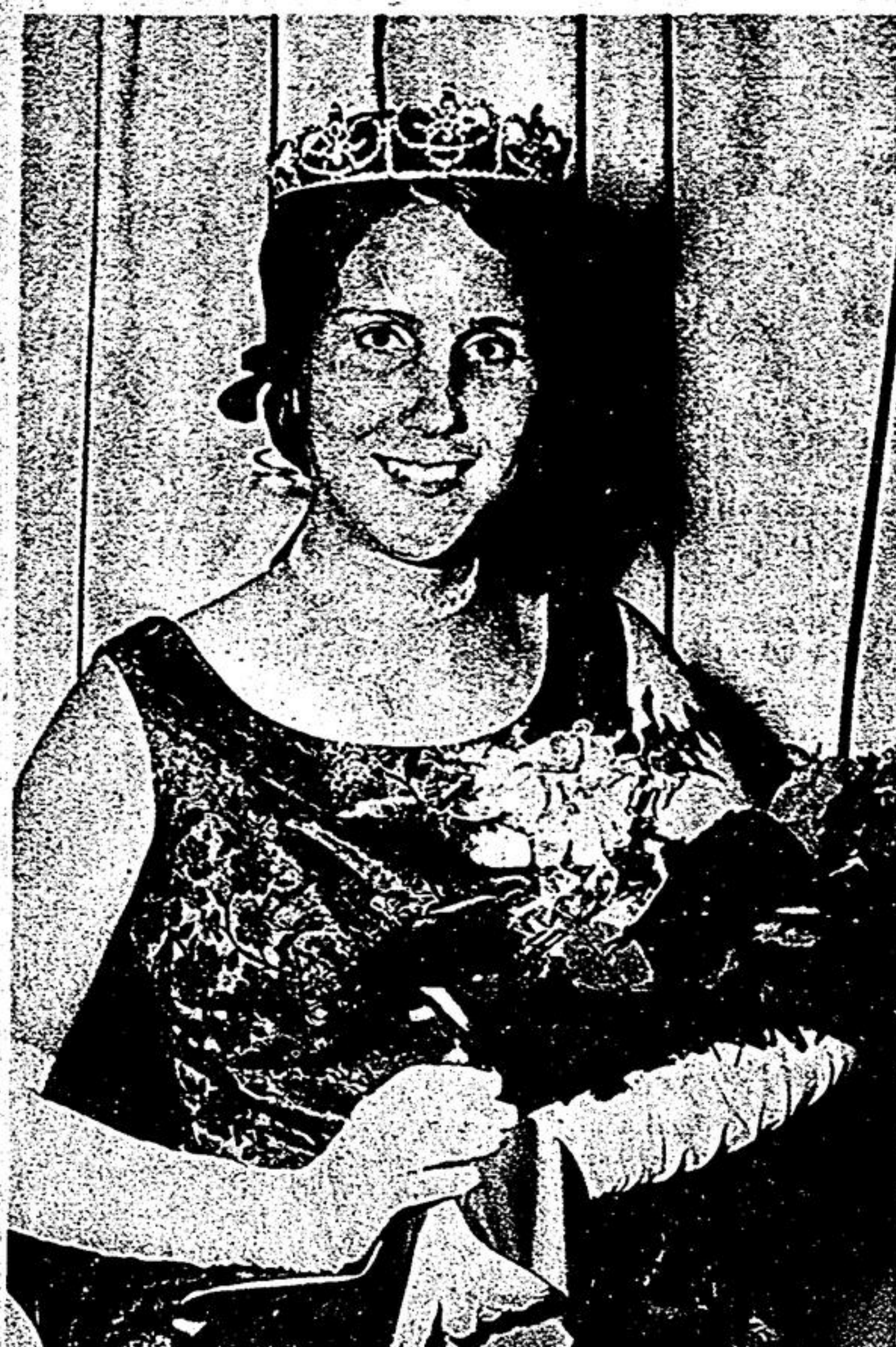
'May Queen' at Markham High