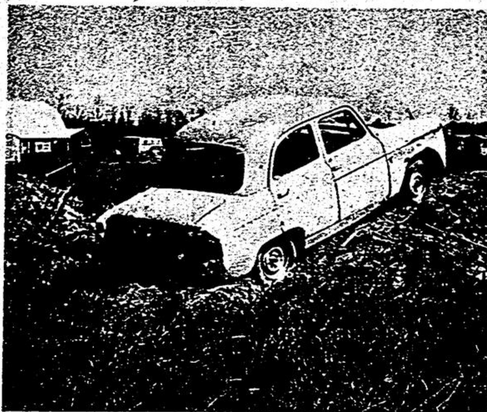
The entrance to the former Village of Stouffville on Hwy. 47 is anything but an attractive advertisement for the community. A partially dismantled car, 'parked' on a private lot, is an example of the way the area has deteriorated.

firms, interested in locating in this area. One is a company with a base in Belleville. This week, I met with officials of the Ontario Development Corporation in an effort to have Whitchurch-Stouffville reinstated in the Industrial Development Assistance Program. Question: Do you favor a Board of Education imposed lot fee charge as was suggested in connection with the Dulverton Development?