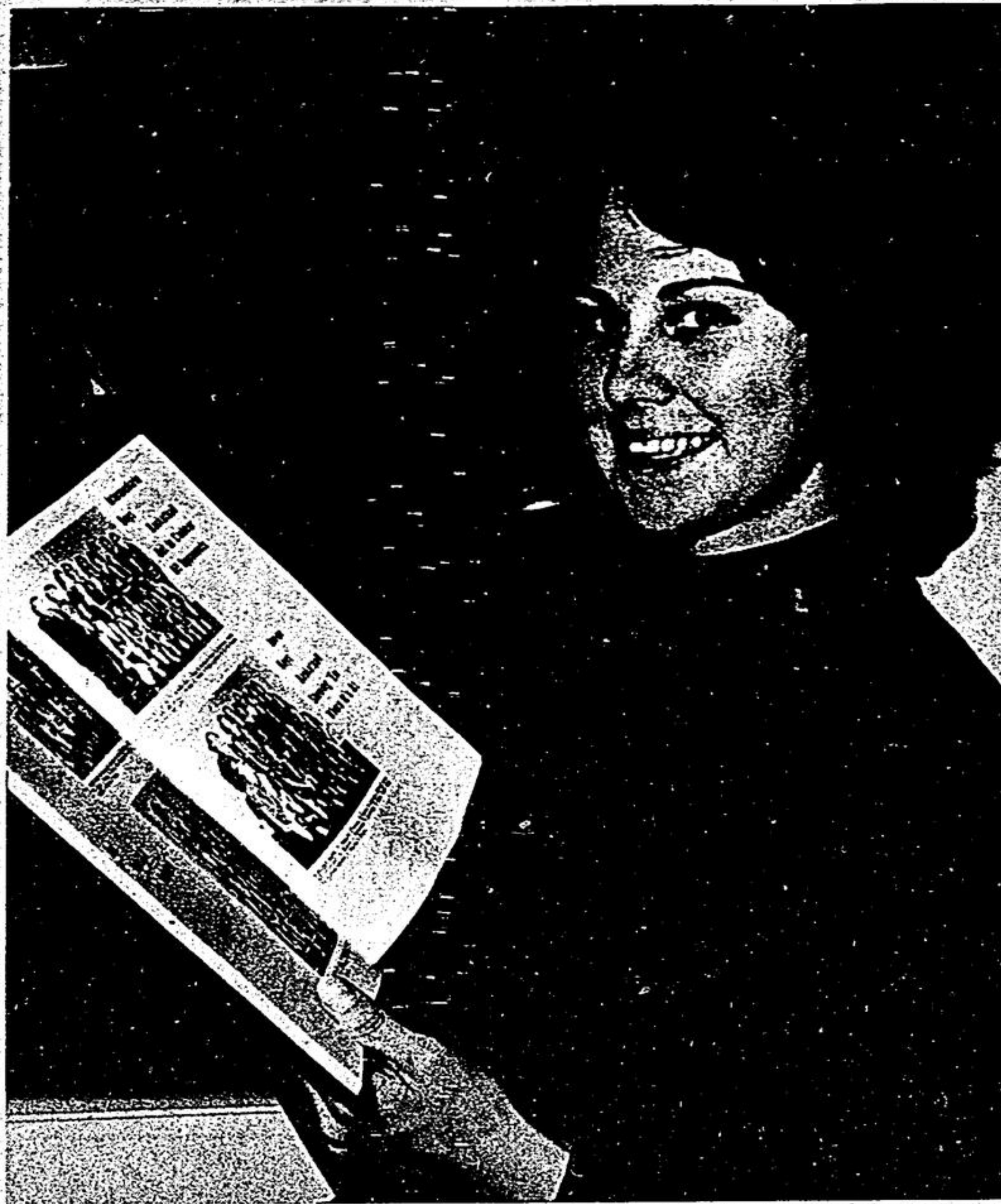
A big job well done

in different countries of the world. The church's concept of world missions centres on the spiritual nature of man. They believe that the non-Christian must experience a change of heart before other areas of his life take on meaning. The Vivian Church shares in the personal support of 14 missionaries serving six countries.