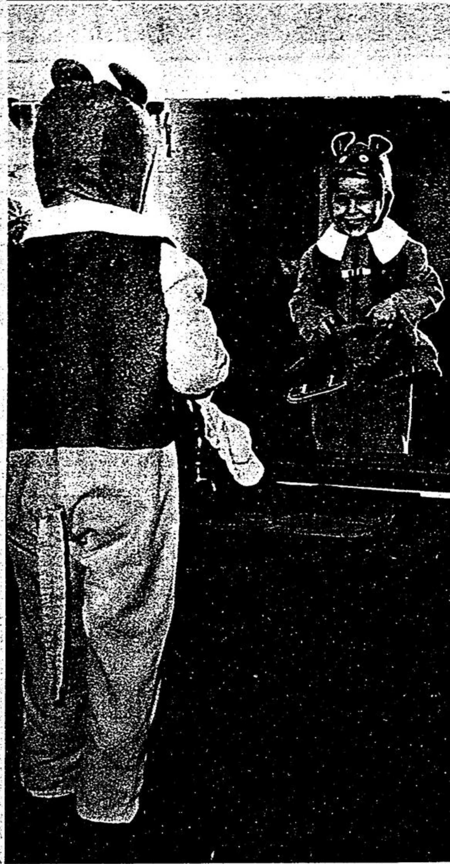
Goodwood boy in carnival debut