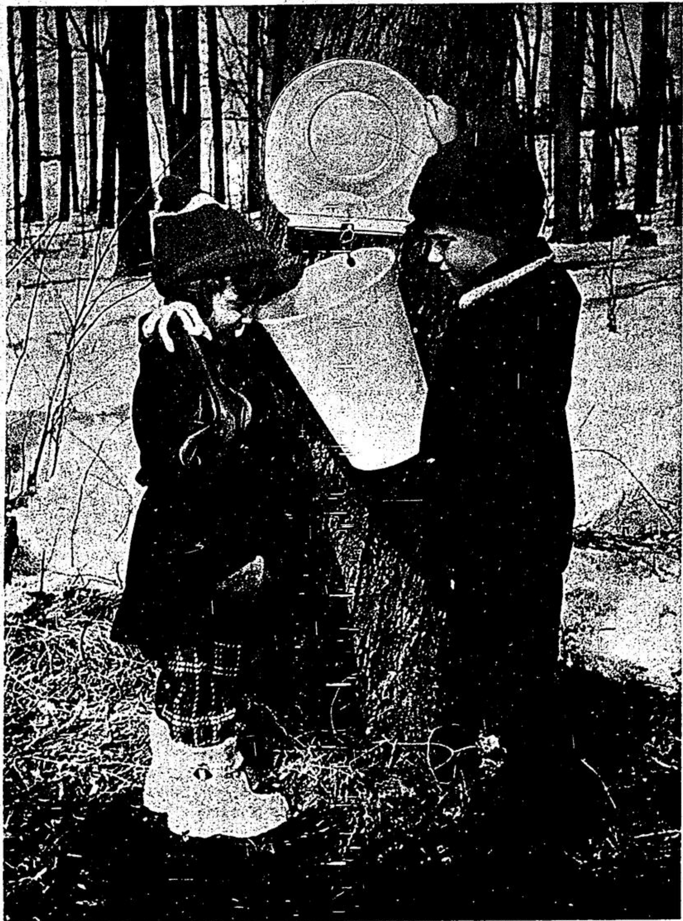
Sap is on the run at Bruce's Mill