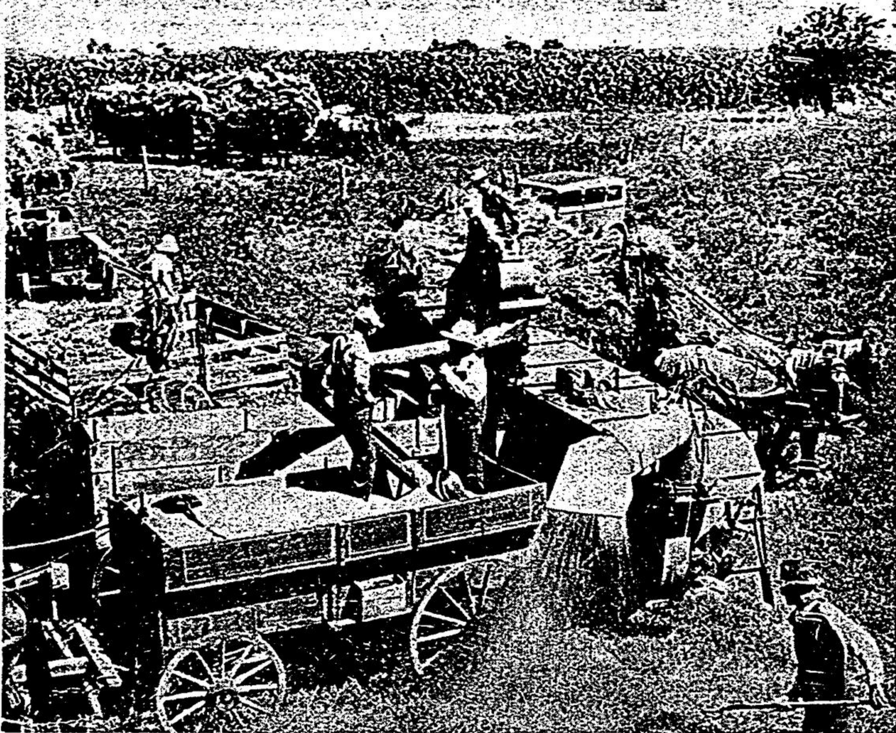
Threshing scenes like this one were common on farms during the 1940's. Threshing out the grain required so much labor that it was a cooperative job. Farmers hired custom crews or joined with neighbors to form threshing gangs that moved from farm to farm. Today, just one man and a single machine, the modern combine complete the grain harvesting operation from cutting to separation.