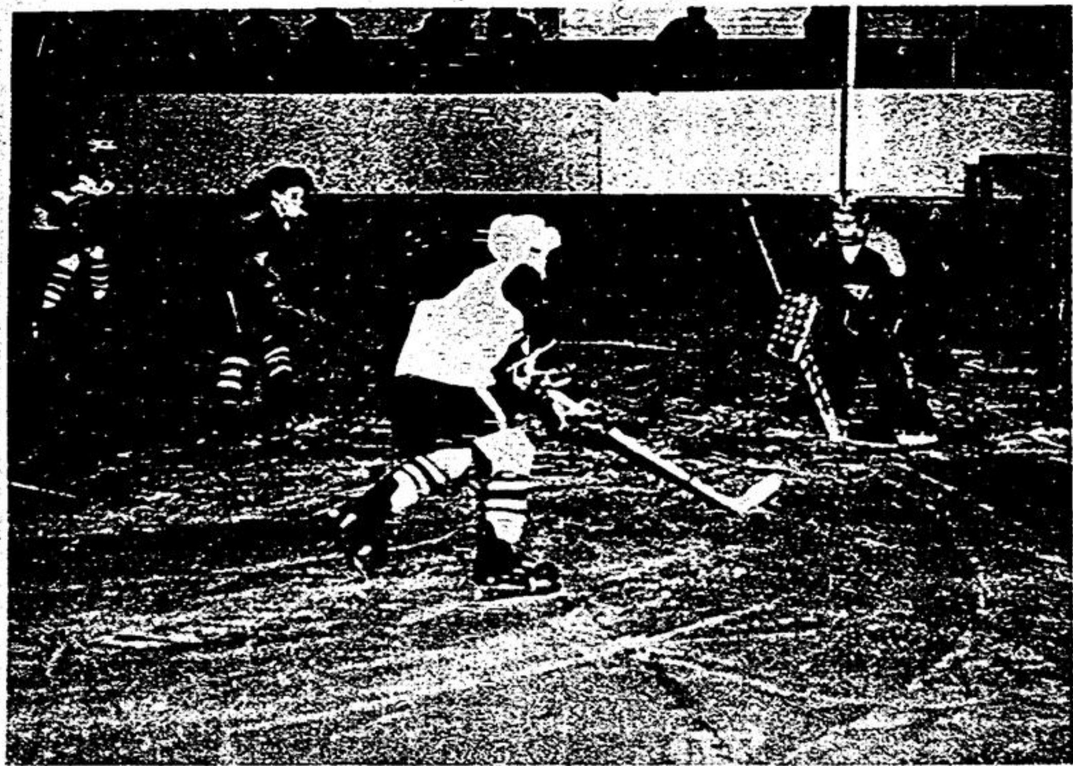
Peewee winger in playoff scoring bid