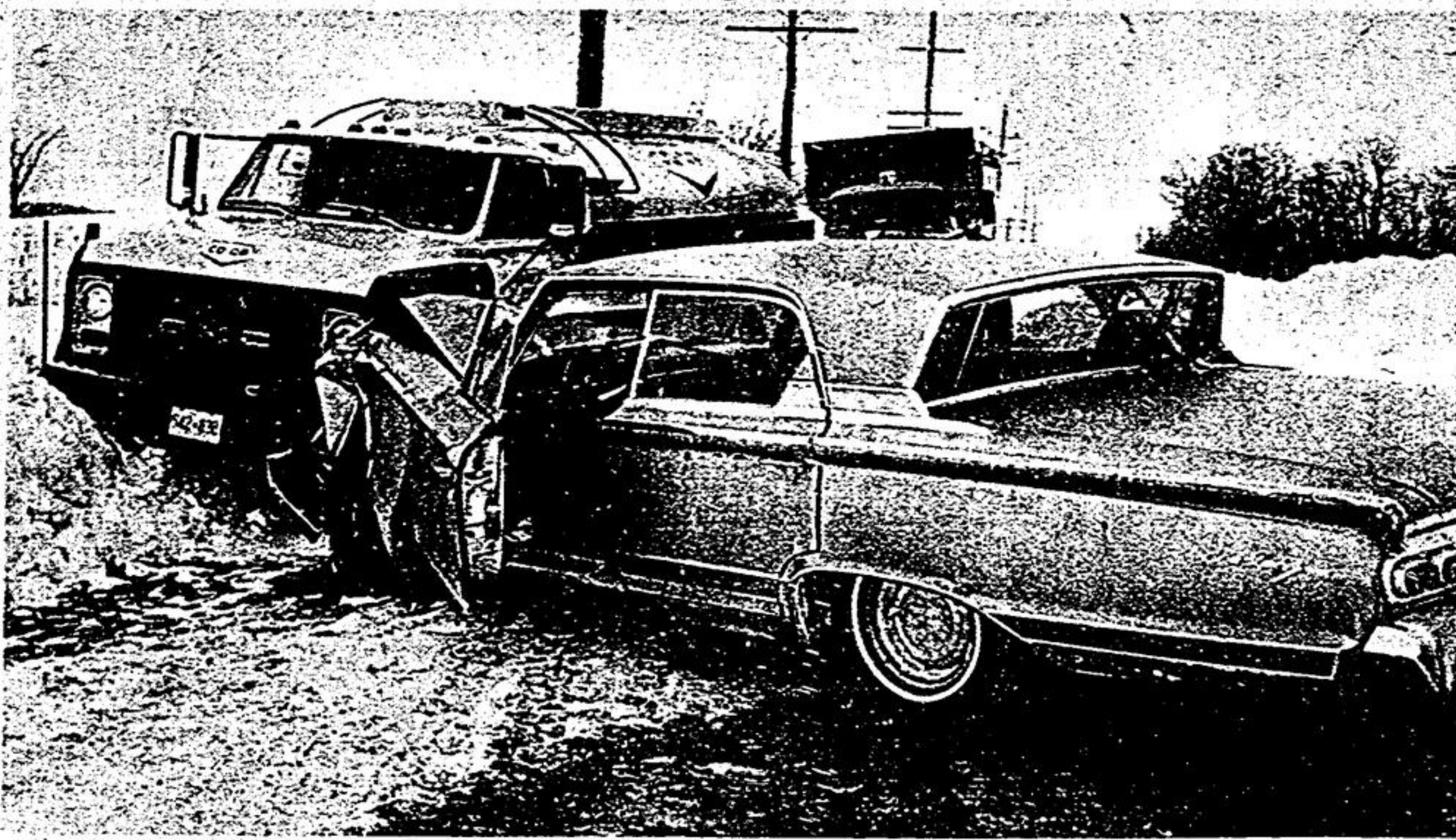
Car - fuel truck collide near Island Lake