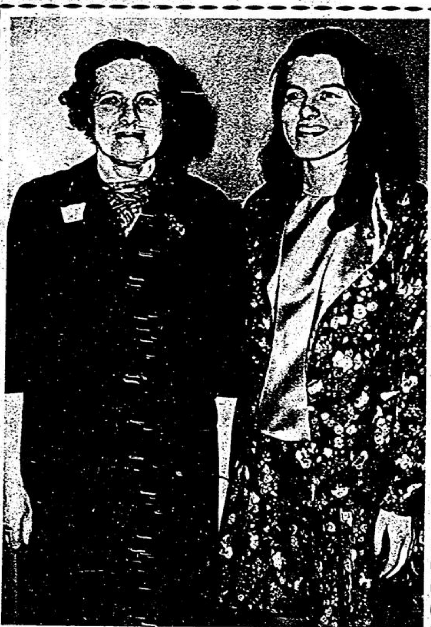
Mother & daughter receive awards