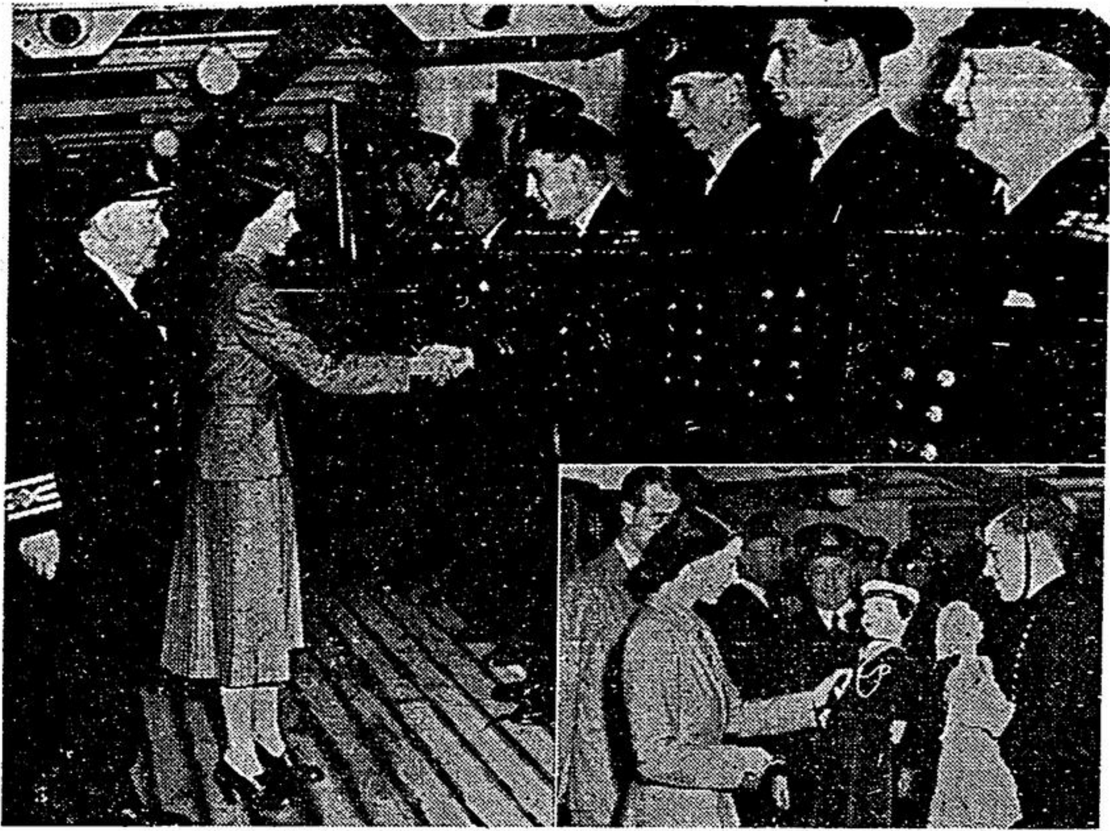
When Princess Elizabeth and Prince Philip returned home aboard the Empress of Scotland, 26,300-ton flagship of the Canadian Pacific Atlantic fleet, following a triumphant tour of Canada, officers and members of the ship's crew were formally presented (top