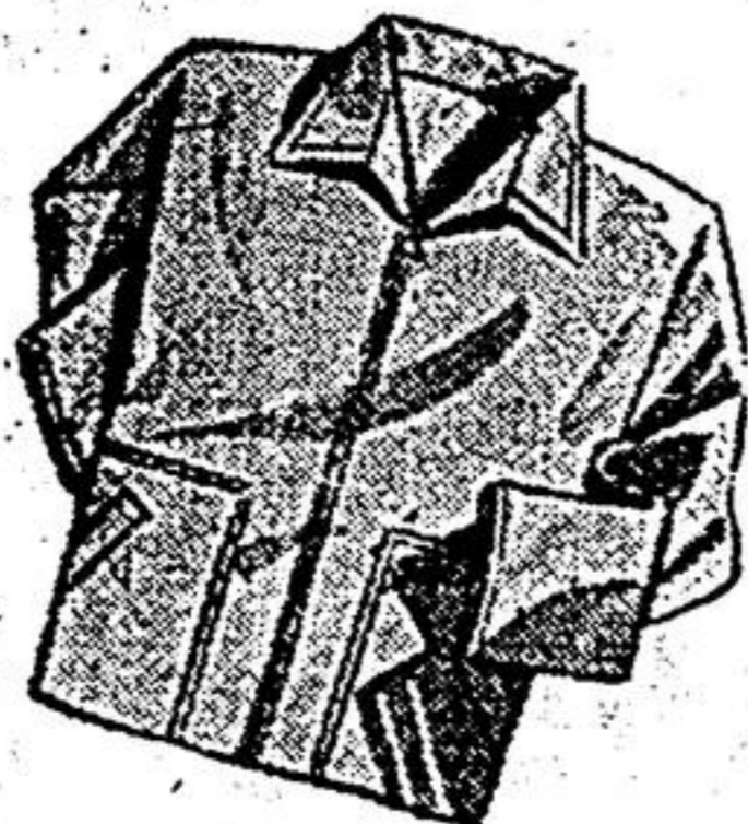
For Cool Summer Evenings—All Sizes.