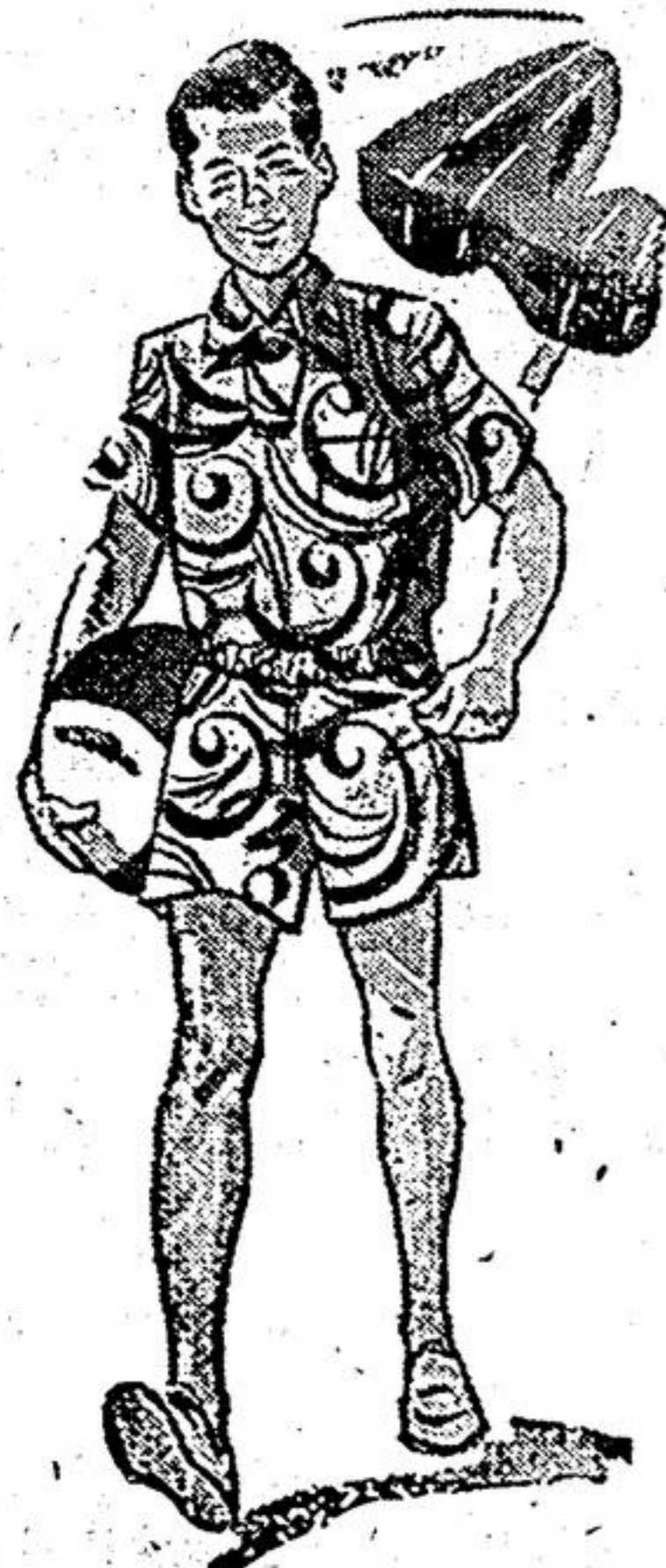
Summer Togs For Boys